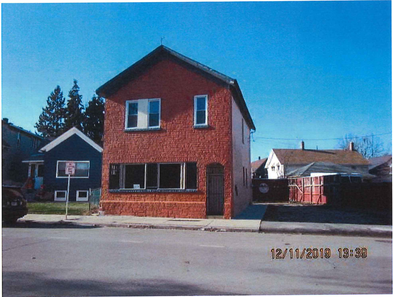
2169 South Muskego Ave