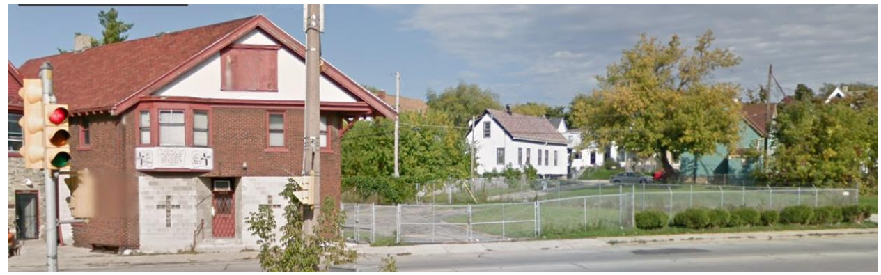
Existing building and site conditions at 2340 West Hopkins Street.