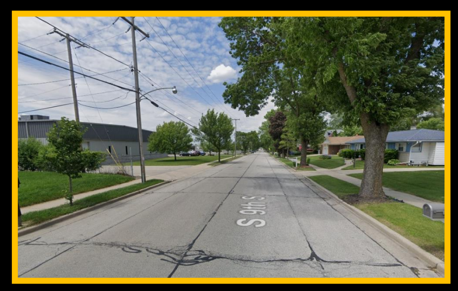
View from South 9th Street looking south