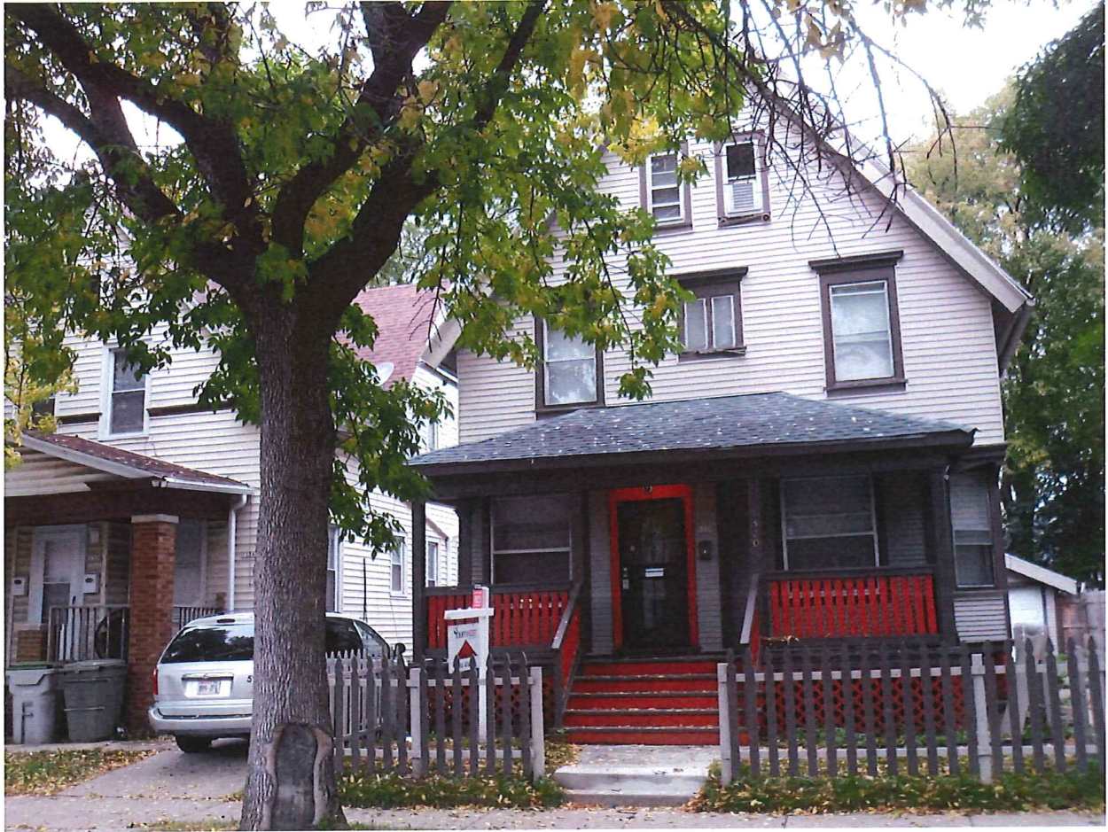
1320 W Locust