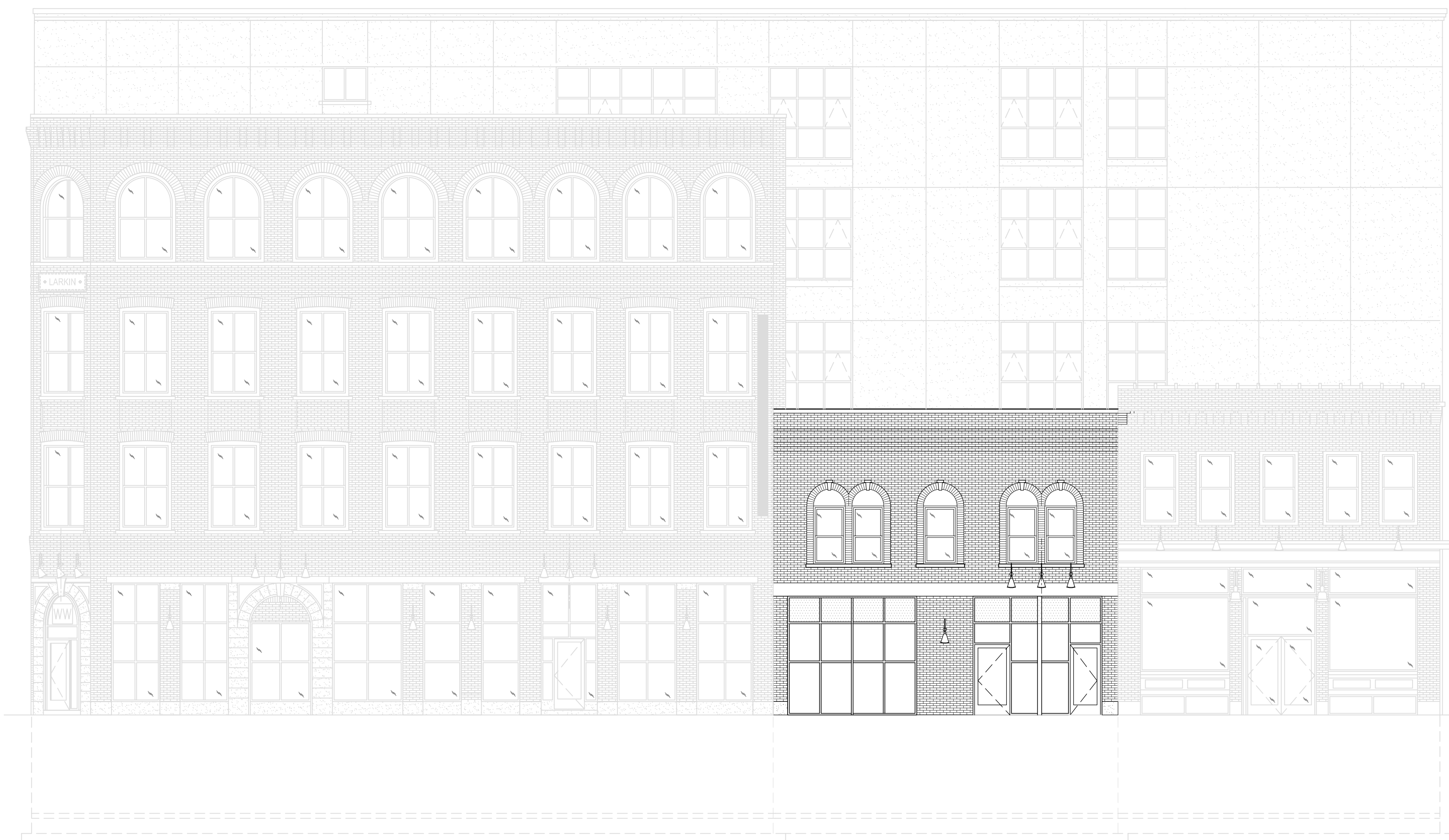
1 2ND STREET WEST ELEVATION 1/8" = 1'-0"

Project: The Artisan at Walker's Point - BBJ Linen Tenant Buildout