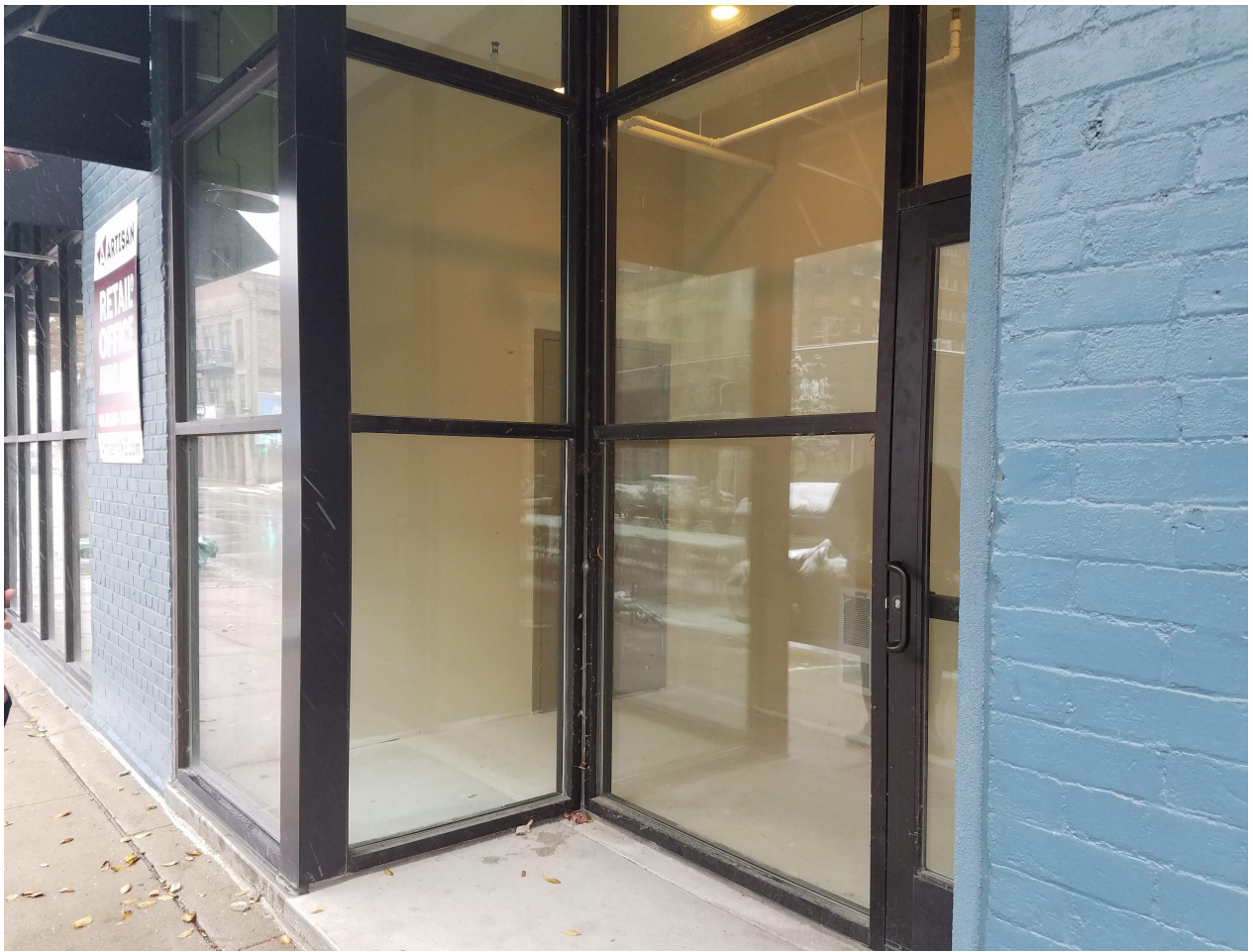
EXTERIOR ENTRY VIEW LOOKING NORTH