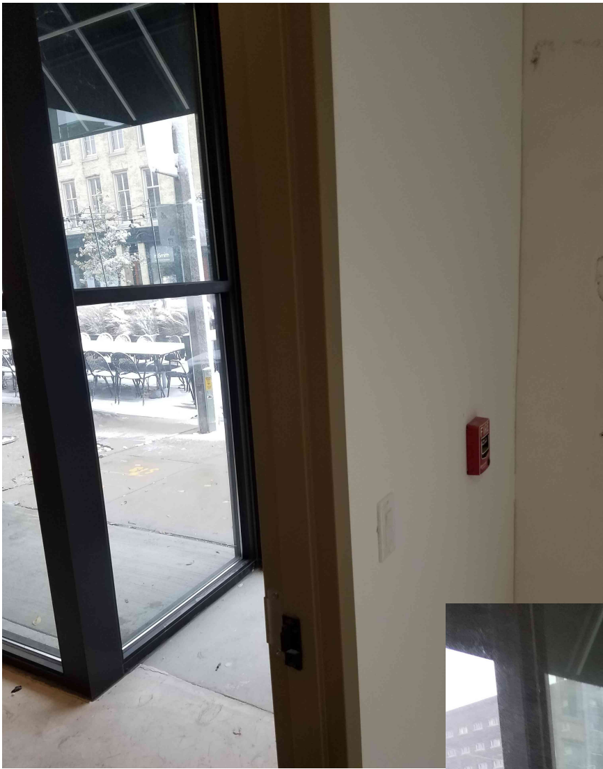
INTERIOR VIEW OF ENTRY #1