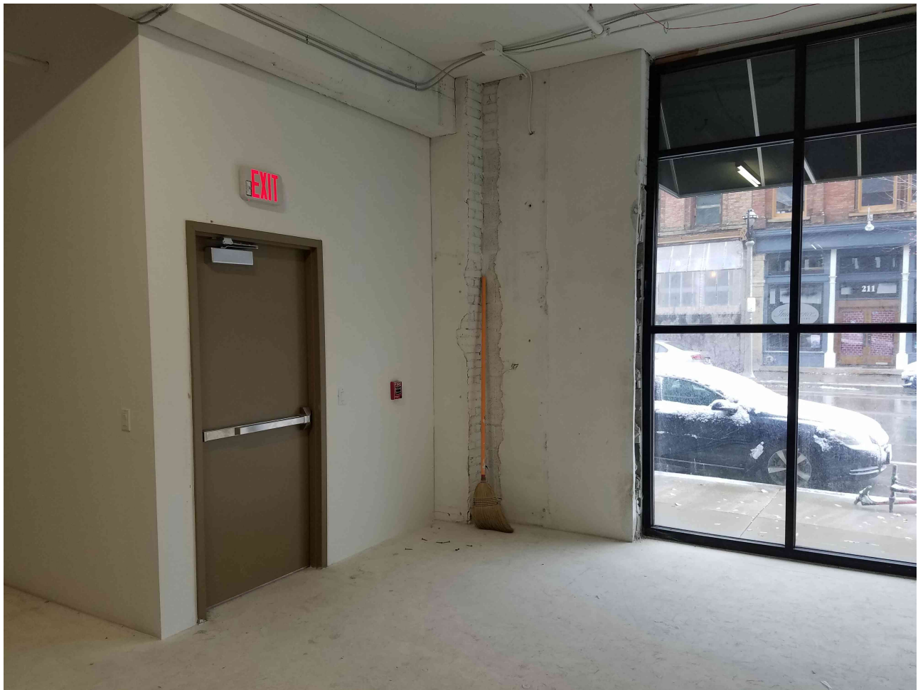
INTERIOR VIEW OF VESTIBULE