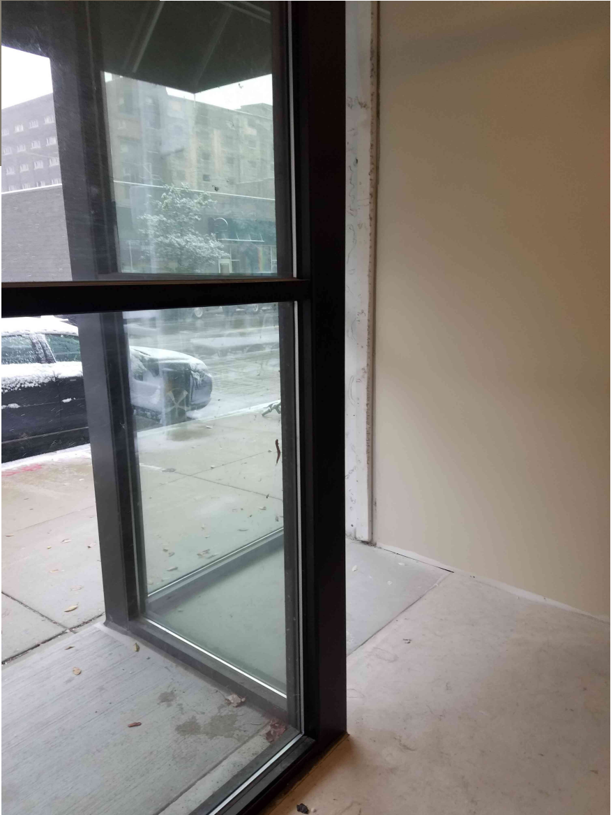
INTERIOR VIEW OF ENTRY #2