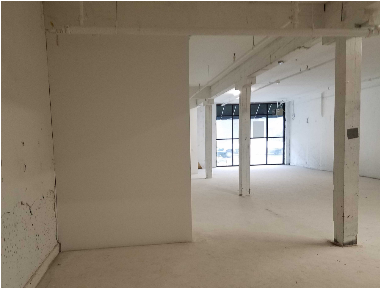
INTERIOR VIEW LOOKING EAST AT STOREFRONT