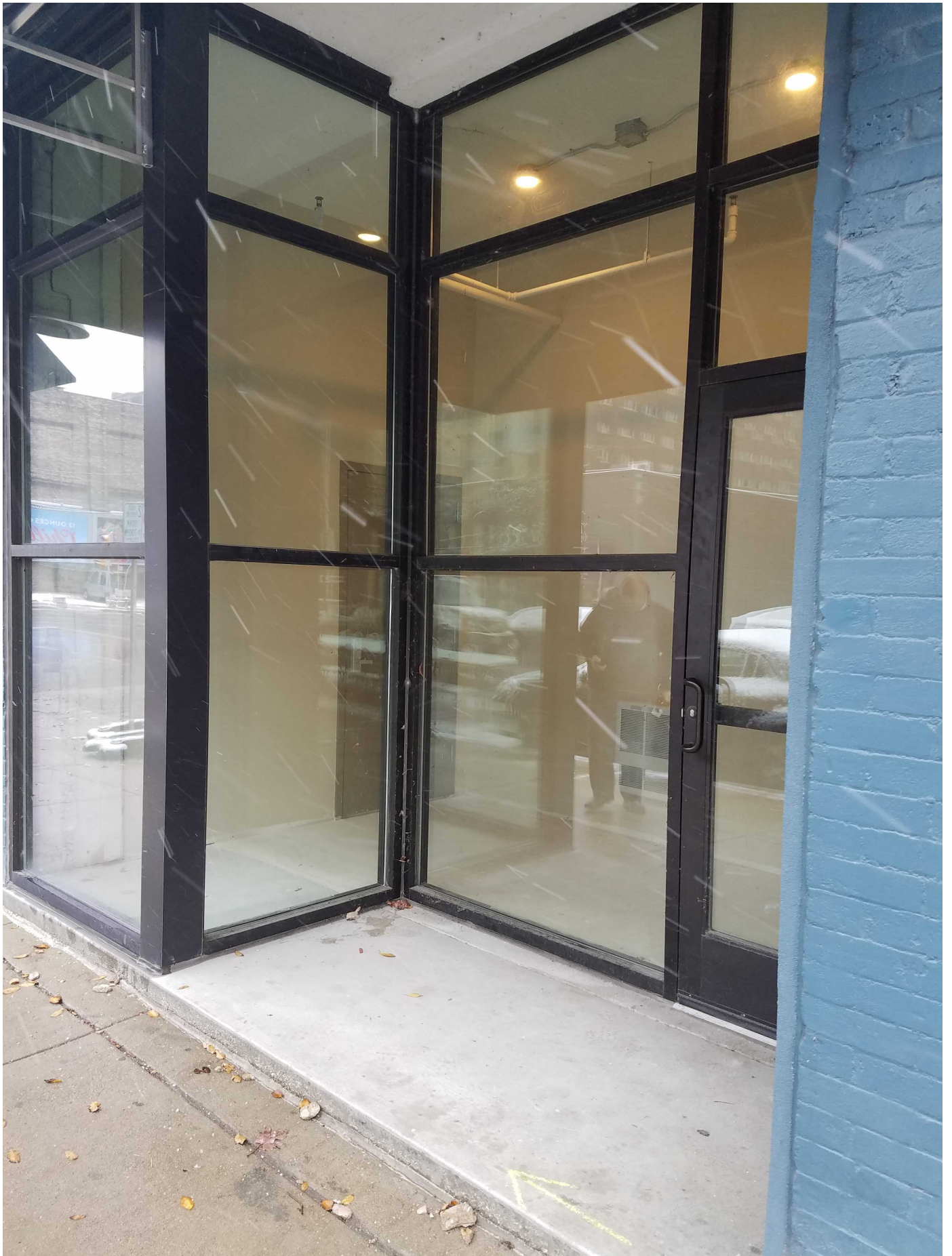
EXTERIOR VIEW LOOKING @ ENTRY