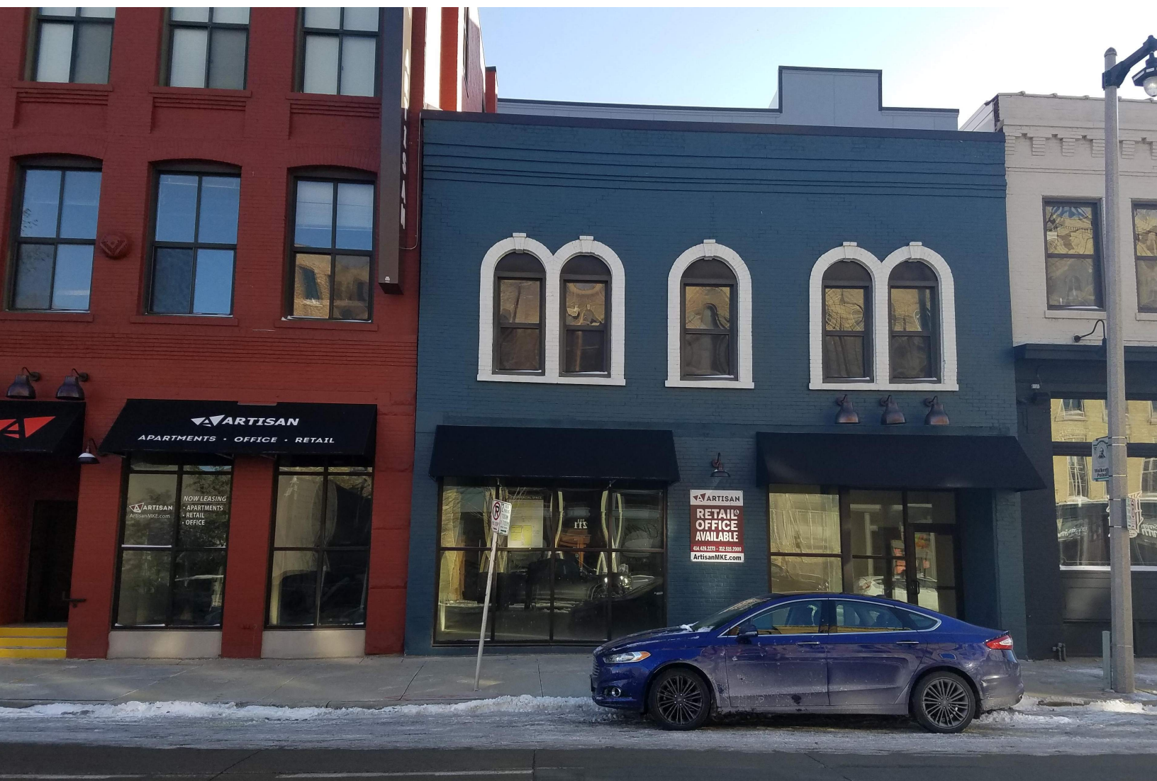
EXTERIOR ELEVATION VIEW LOOKING EAST