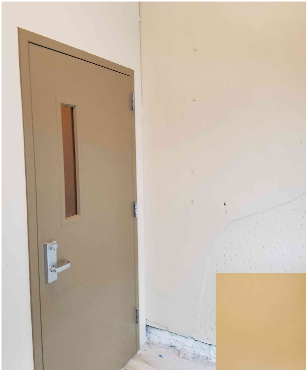
INTERIOR VIEW OF DOOR TO UPSTAIRS