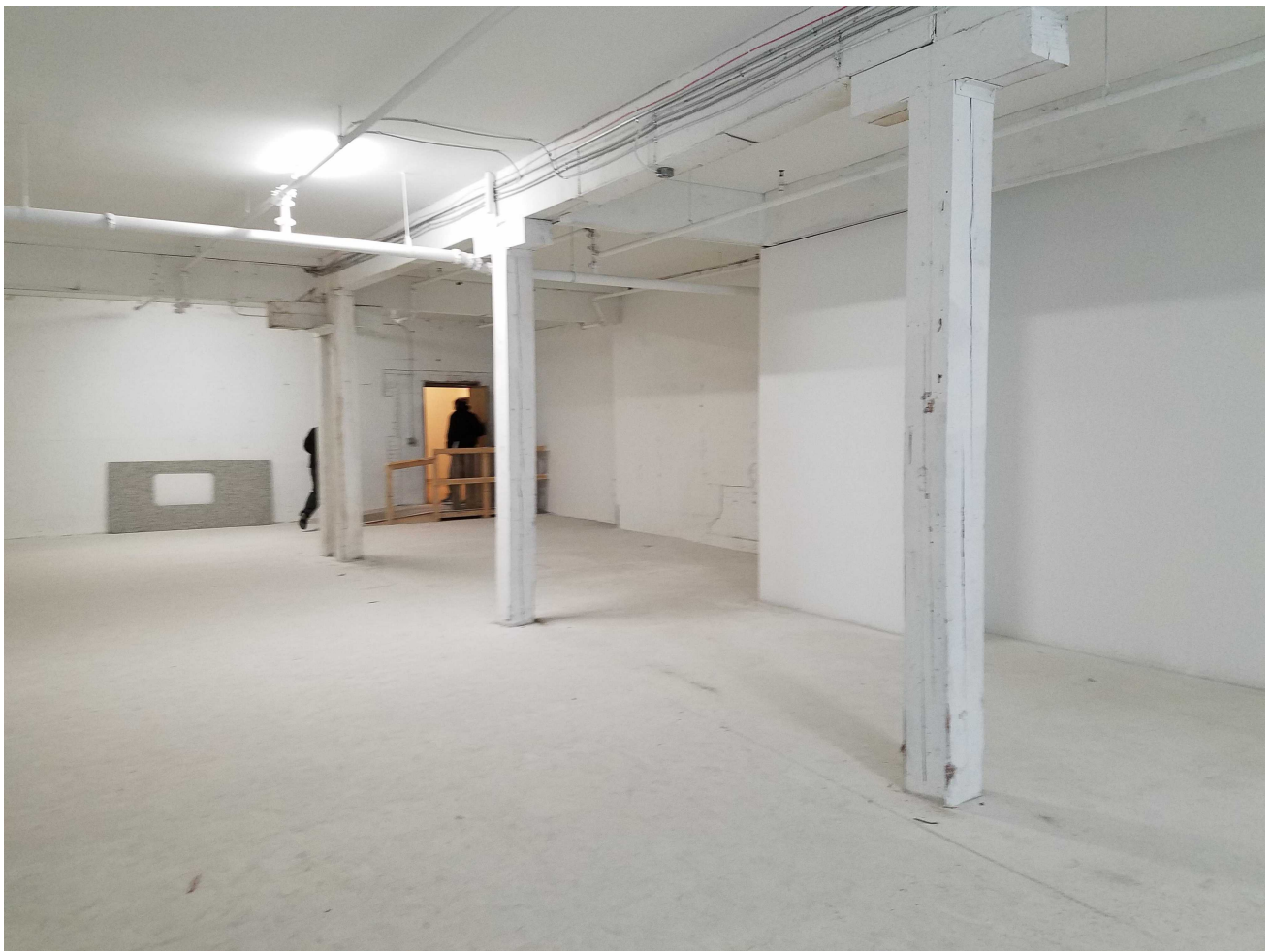
INTERIOR VIEW LOOKING EAST