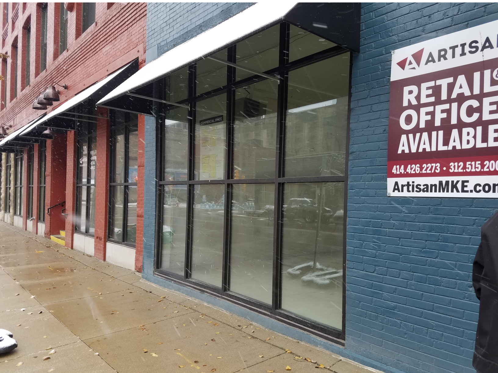
EXTERIOR ELEVATION VIEW LOOKING NORTH