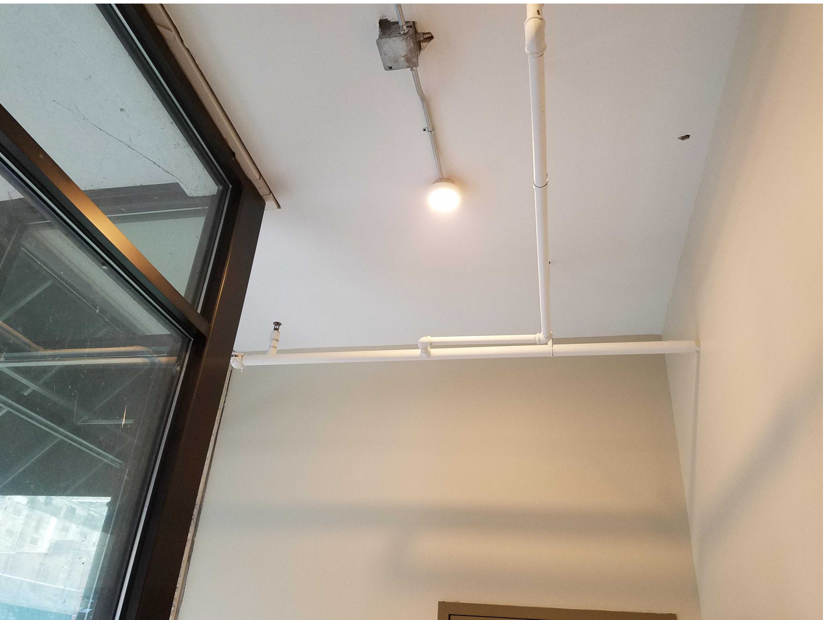
INTERIOR VIEW OF ENTRY CEILING