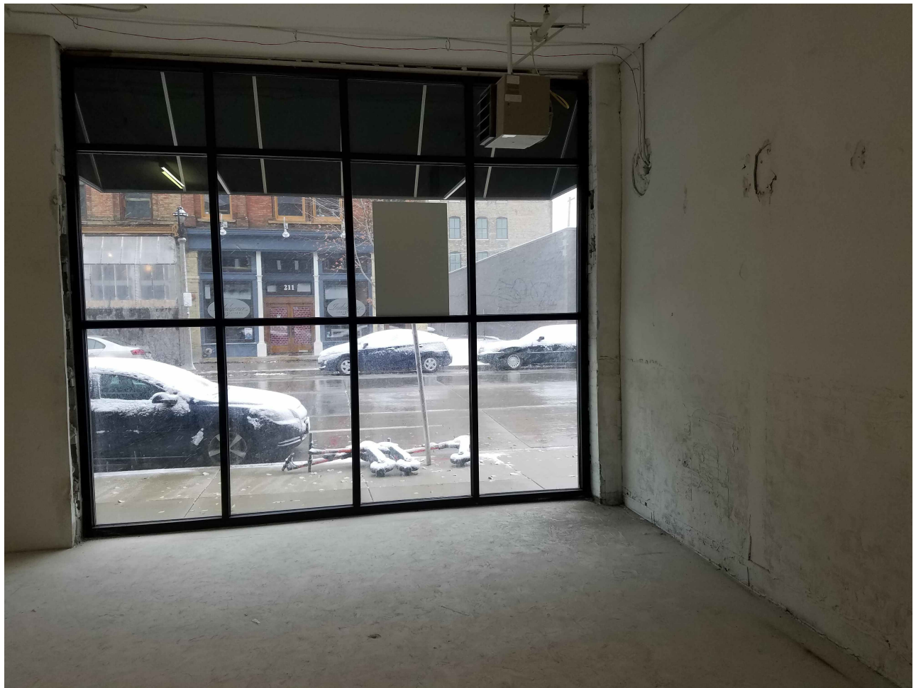
INTERIOR VIEW OF STOREFRONT