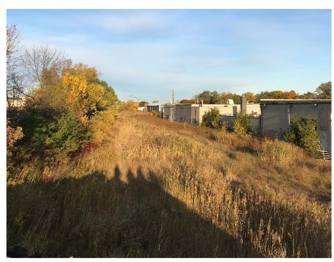
Rails to Trails Conservancy Proposed Route of the Badger Trail Network