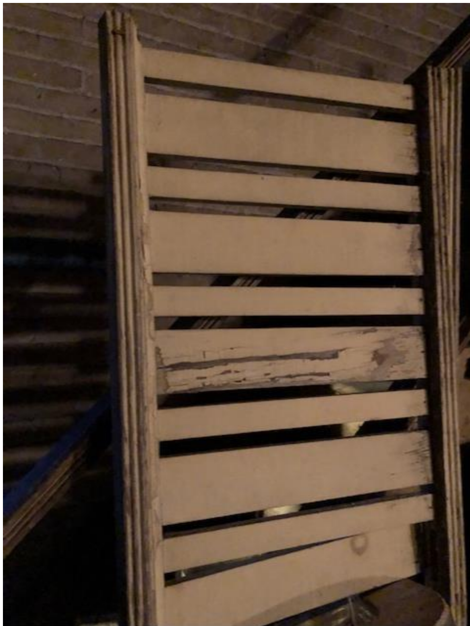
Image of the existing railing removed and saved by previous owner

New railings will be made of wood and match the design of the handrail, bottom rail, and balusters exactly.