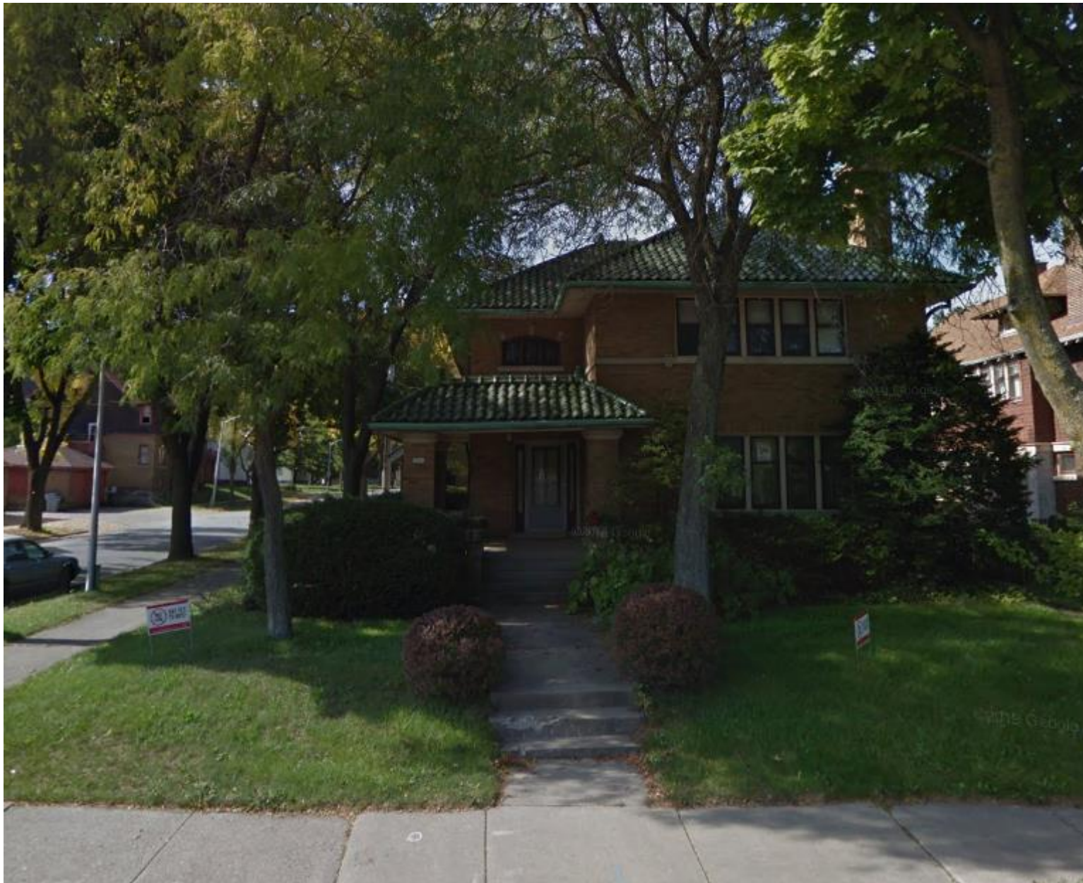
Street view of the front of the home ca. Oct 2015