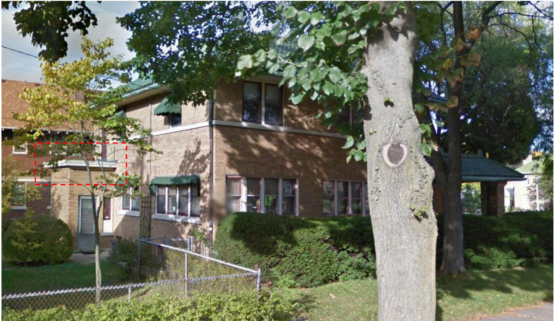
Image of the rear of the home ca. Oct 2015

Upper rear porch railing will be built in area indicated in red