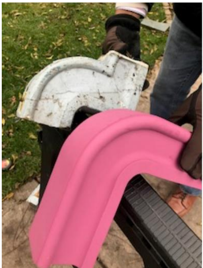
Photographs of the approved handrails to be installed (handrails were already painted and ready for installation at the time of photograph)