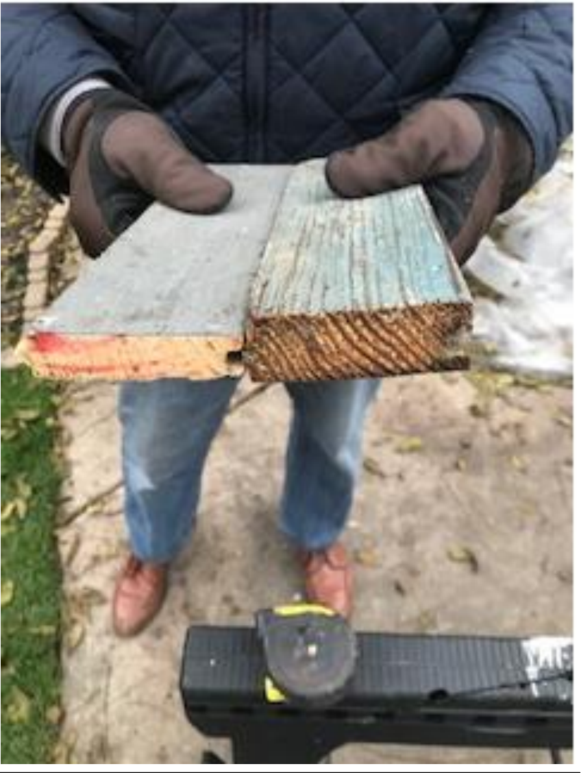
(Left) Photographs of the approved balusters (balusters were already painted and ready for installation at the time of photograph)

(Right) Also in the process of removing the porch, applicant discovered that the decking was made of 3/4" pine. Applicant discovered pieces of the original decking which were 5/4". Photograph above of the two materials. Applicant will replace the decking with 5/4" birch and NOT 3/4" pine.