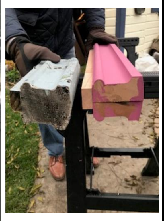
Photographs of the approved handrails to be installed (handrails were already painted and ready for installation at the time of photograph)