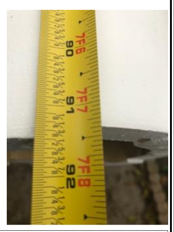
Photographs of the approved fluted cedar columns (columns were already painted and ready for installation at the time of photograph)