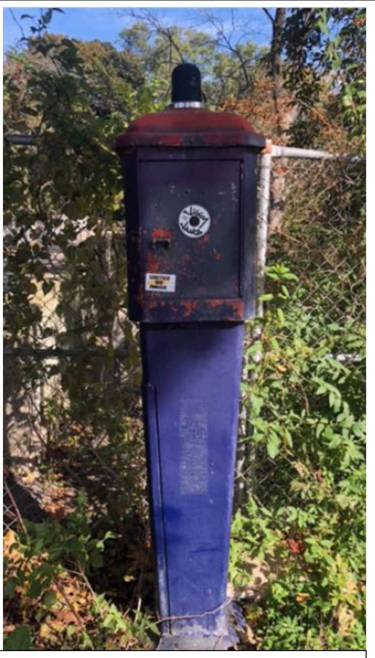
Images of the condition of the inoperable and unused police call box to be removed