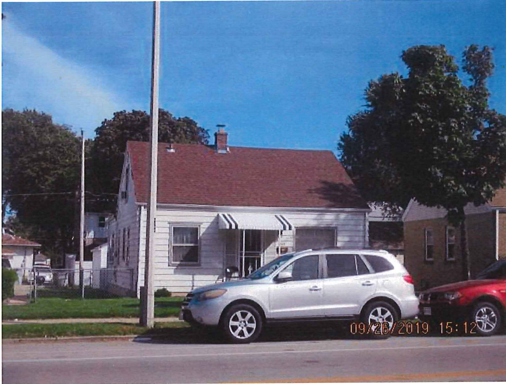
4144 North 51 st Blvd