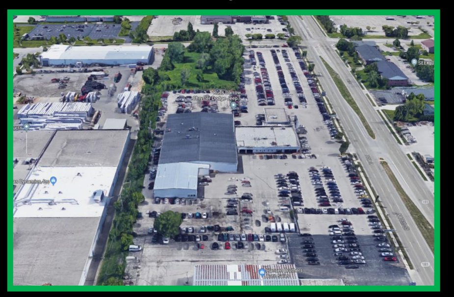
Aerial view looking south