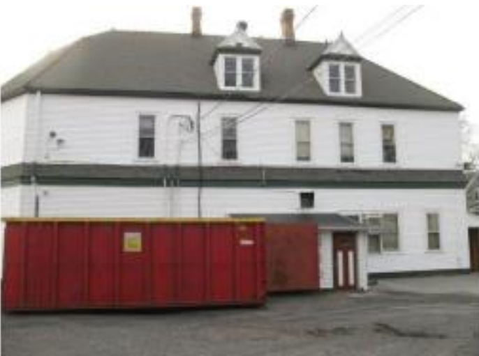
Present condition of rear façade