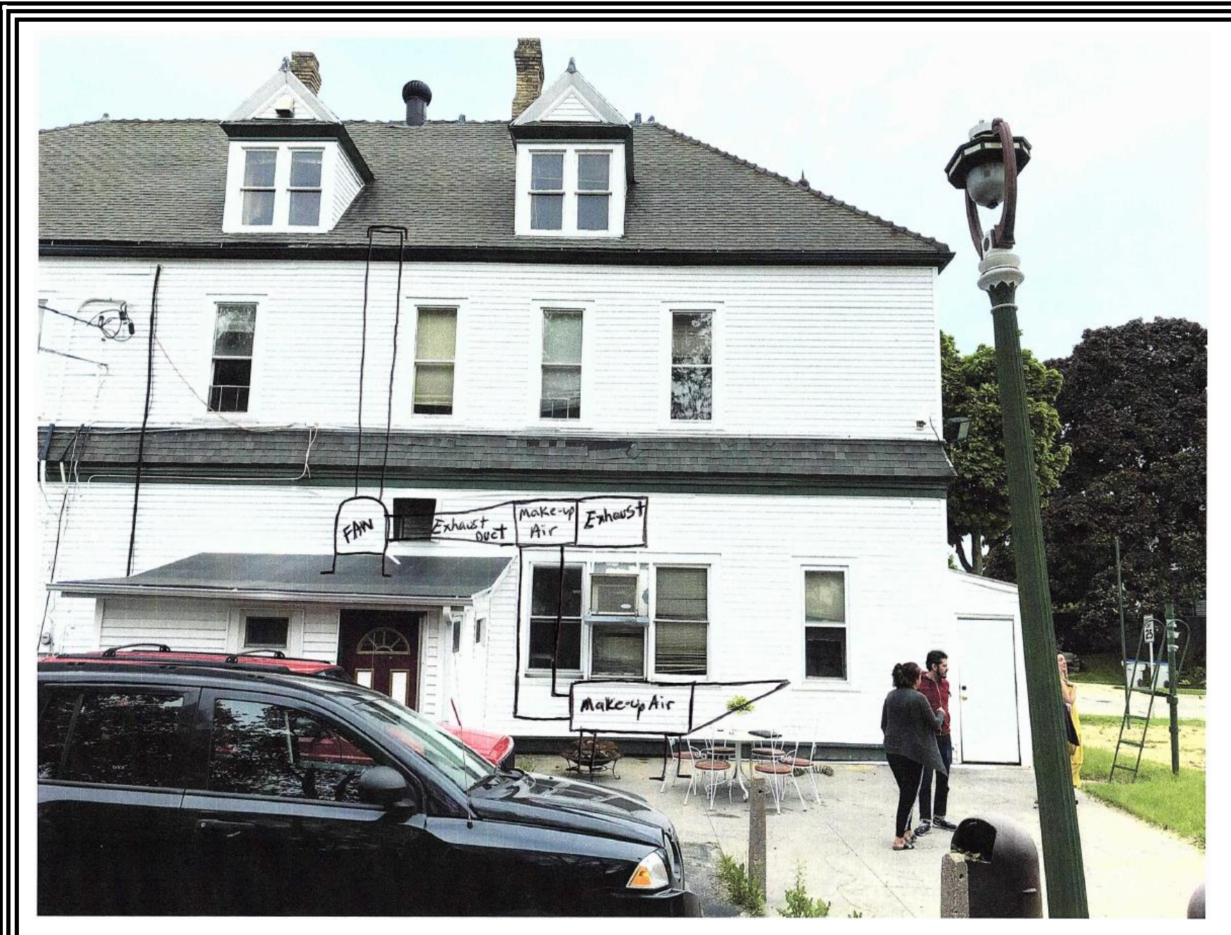
Elevation sketch of the exhaust and make-up air duct work to be completed