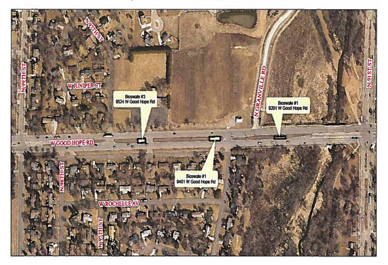
Exhibit A Bioswale Locations