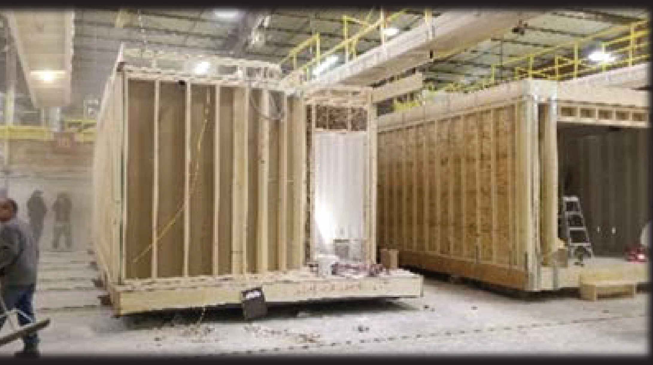
Setting & Fastening