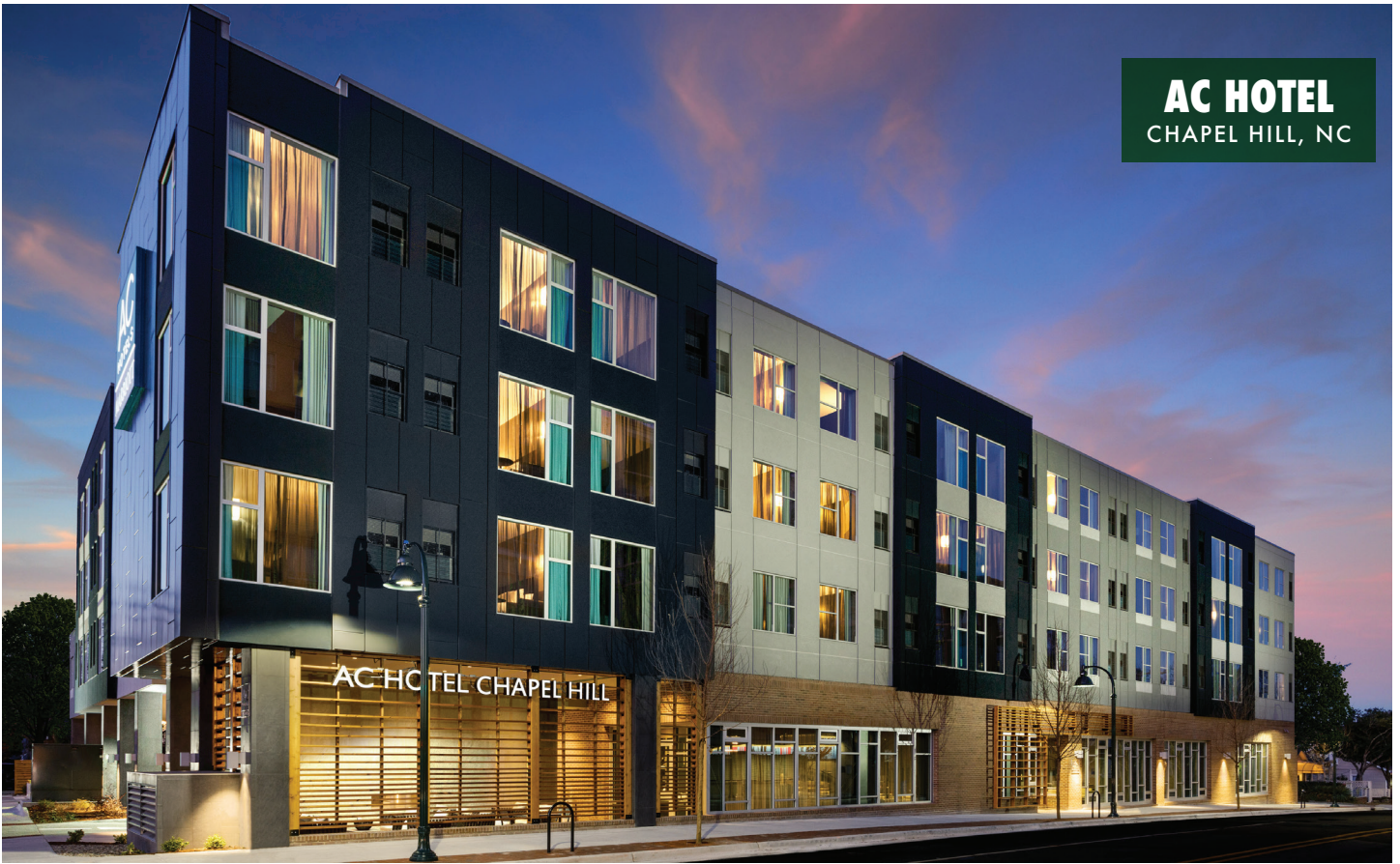
AC HOTEL CHAPEL HILL, NC