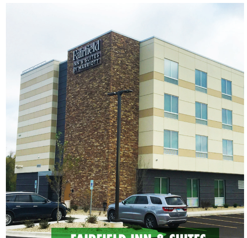
FAIRFIELD INN & SUITES PLEASANT PRAIRIE, WI