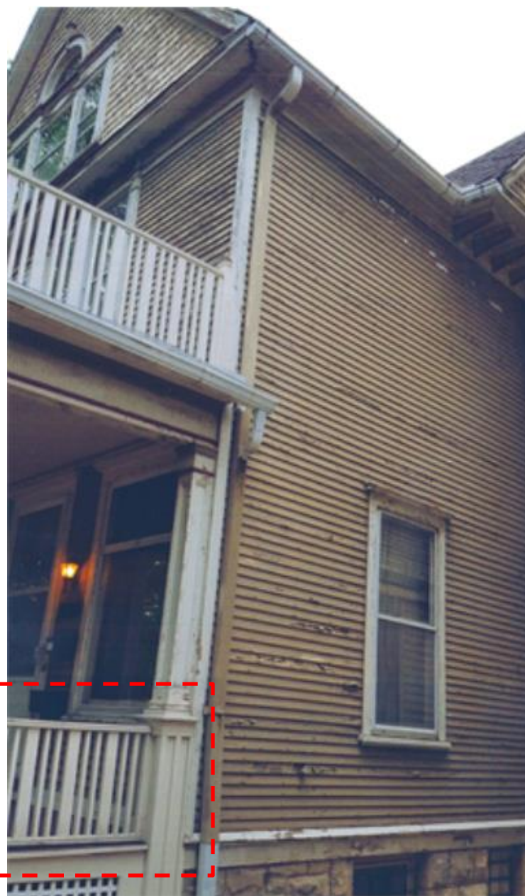
Work to be done on lower front porch ONLY – second photo indicates baluster design to be maintained