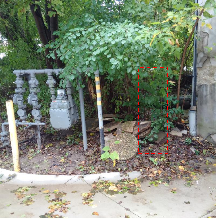
(Left) Image of driveway looking North (Right) Image of existing gas meter, electric meter will be sited to the right as indicated in red