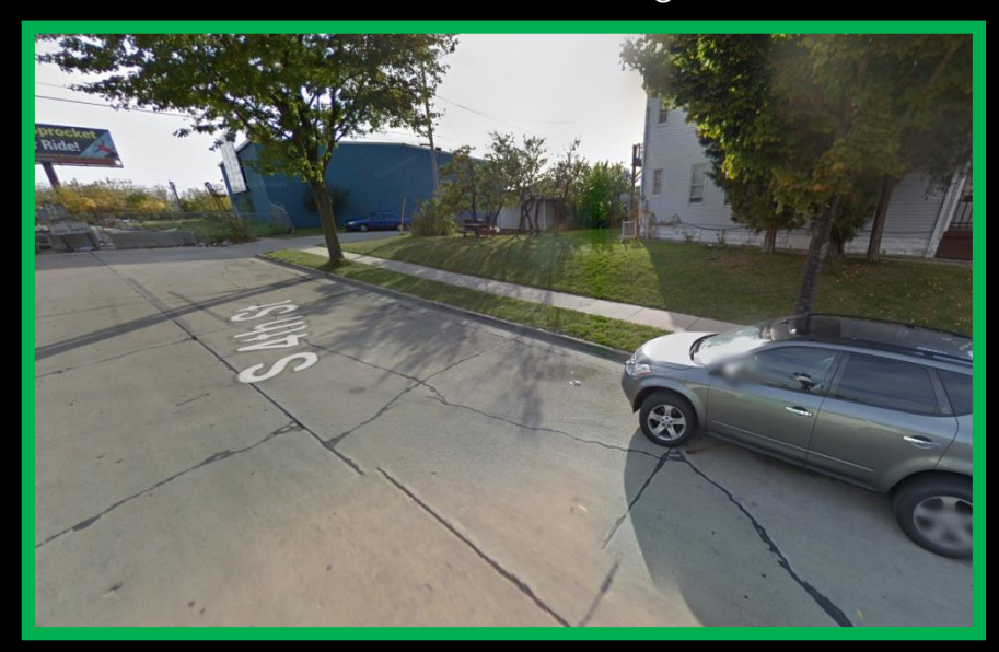
View from South 4th Street looking south-west