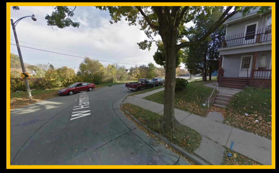
View from West Harrison looking south-east