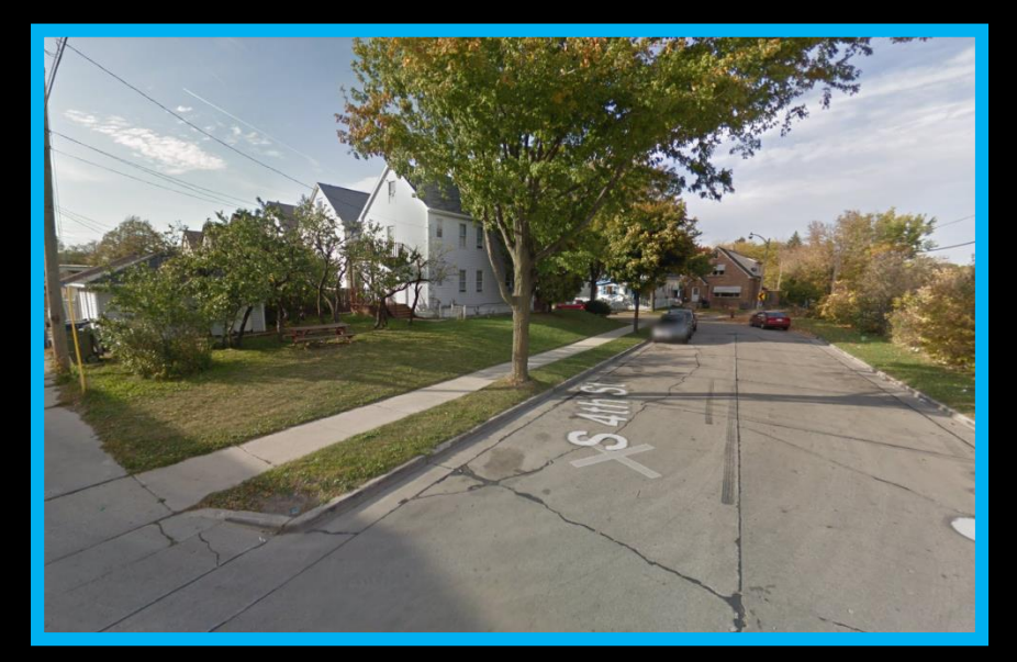
View from South 4th Street looking north-west