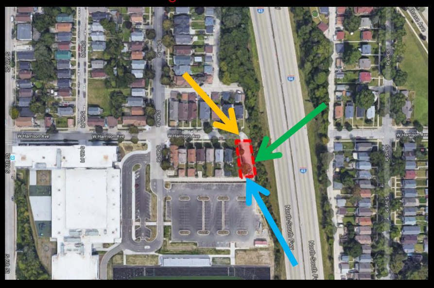
Note: buildings shown have been razed