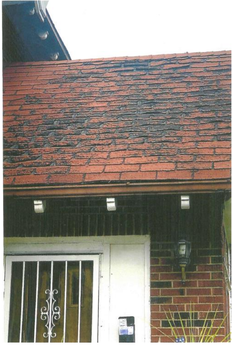
New Atlas Castlebrook shingles to be installed, Burnt Sienna