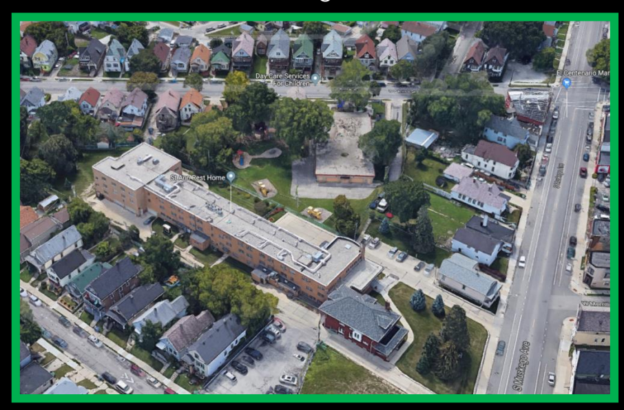
Aerial view looking south