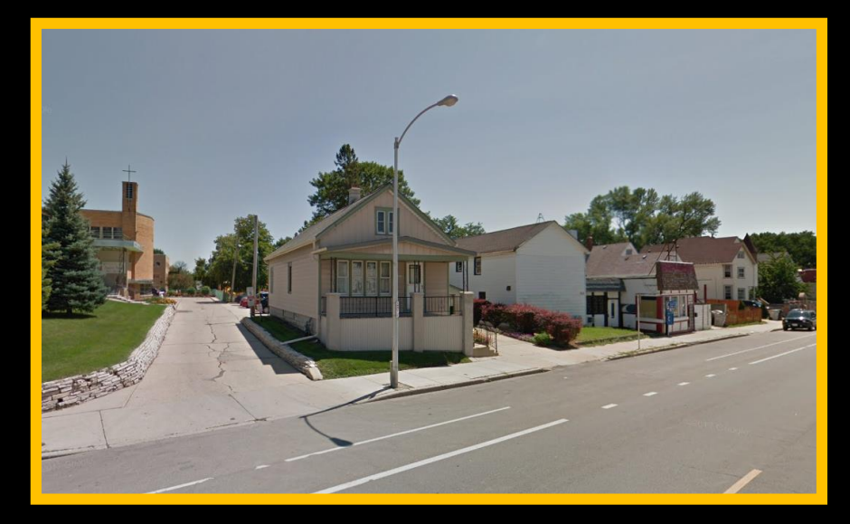
View from South Muskego Avenue south-east