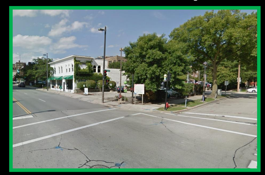
View from East Kilbourn & North Van Buren