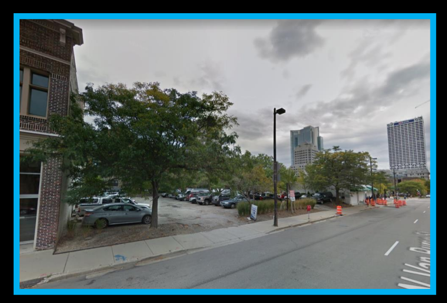
View from North Van Buren Street looking south-east