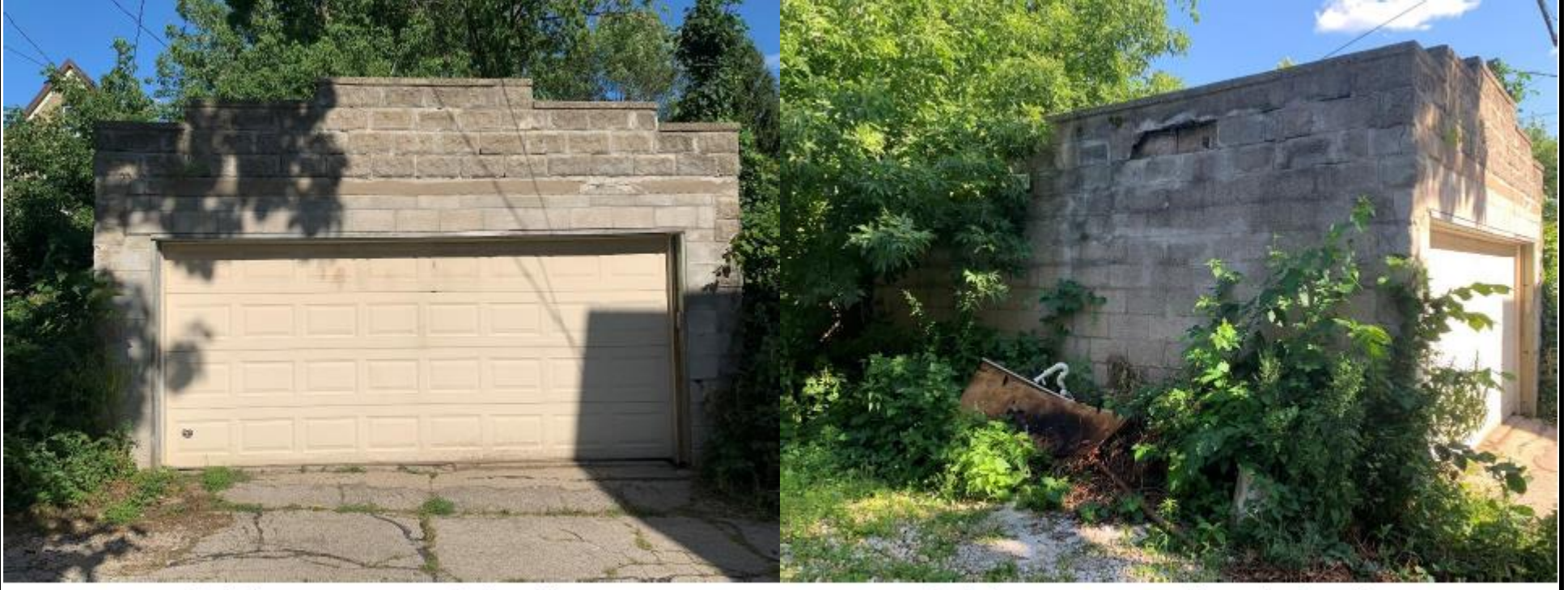
Existing garage west elevation.