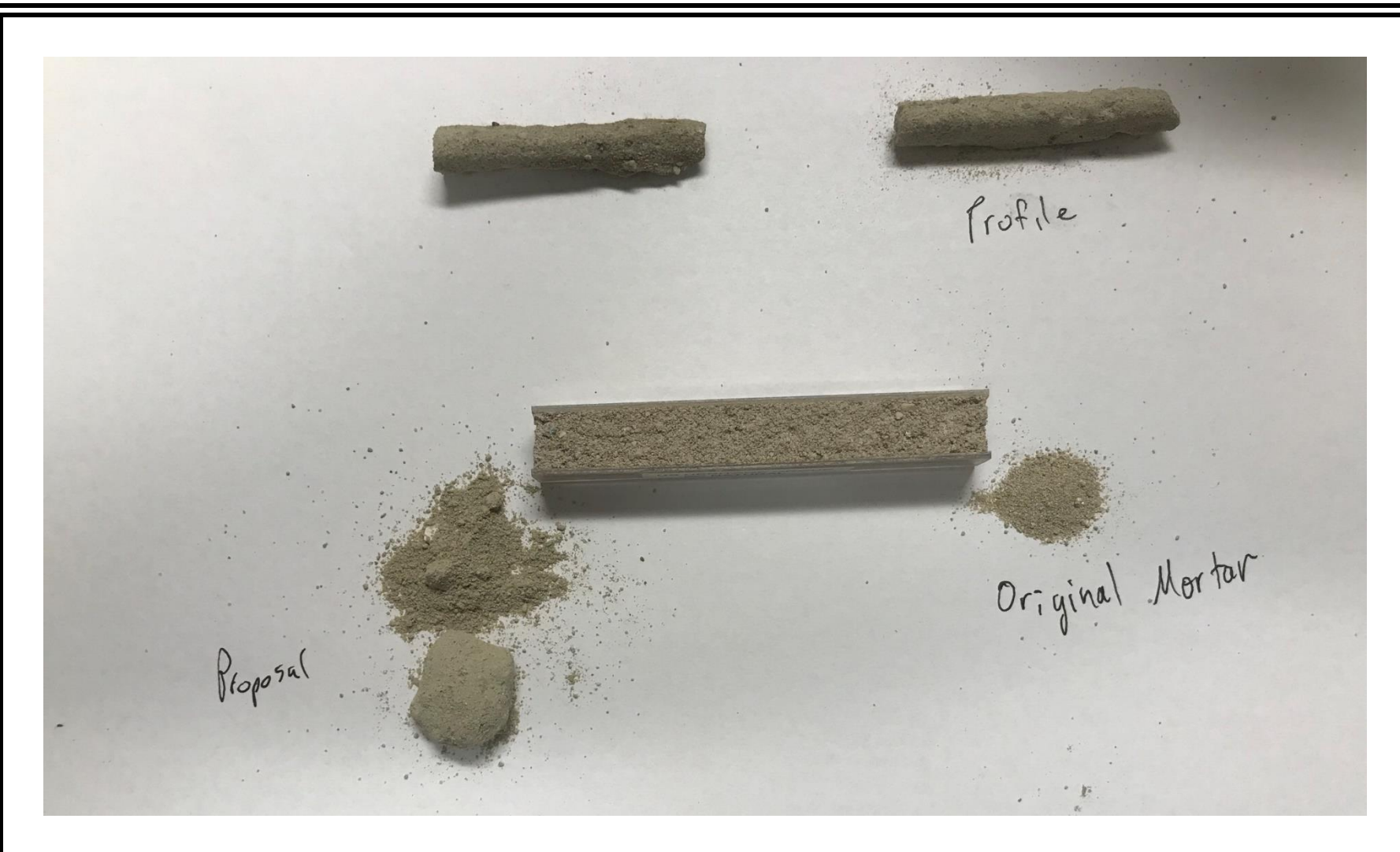
Approved mortar samples and joint profiles.