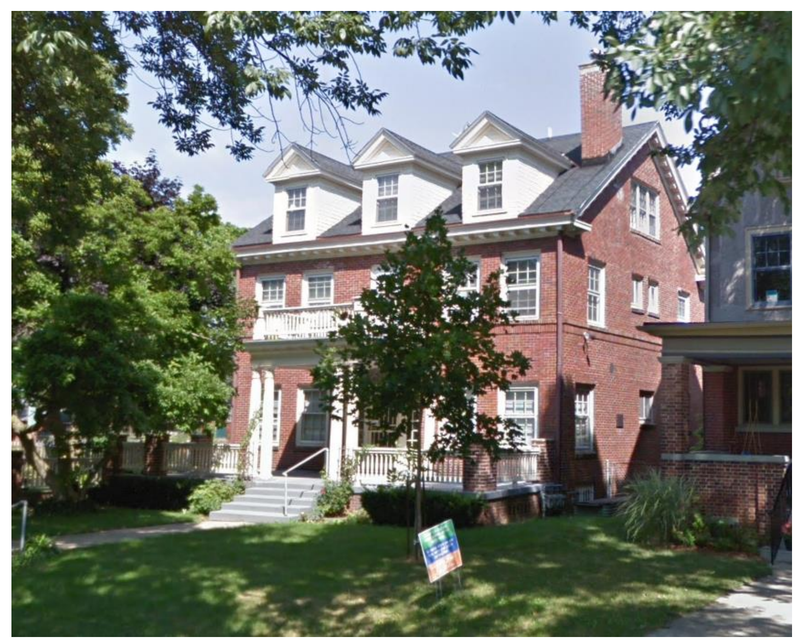
Current condition, 4 existing columns to be removed and replicated