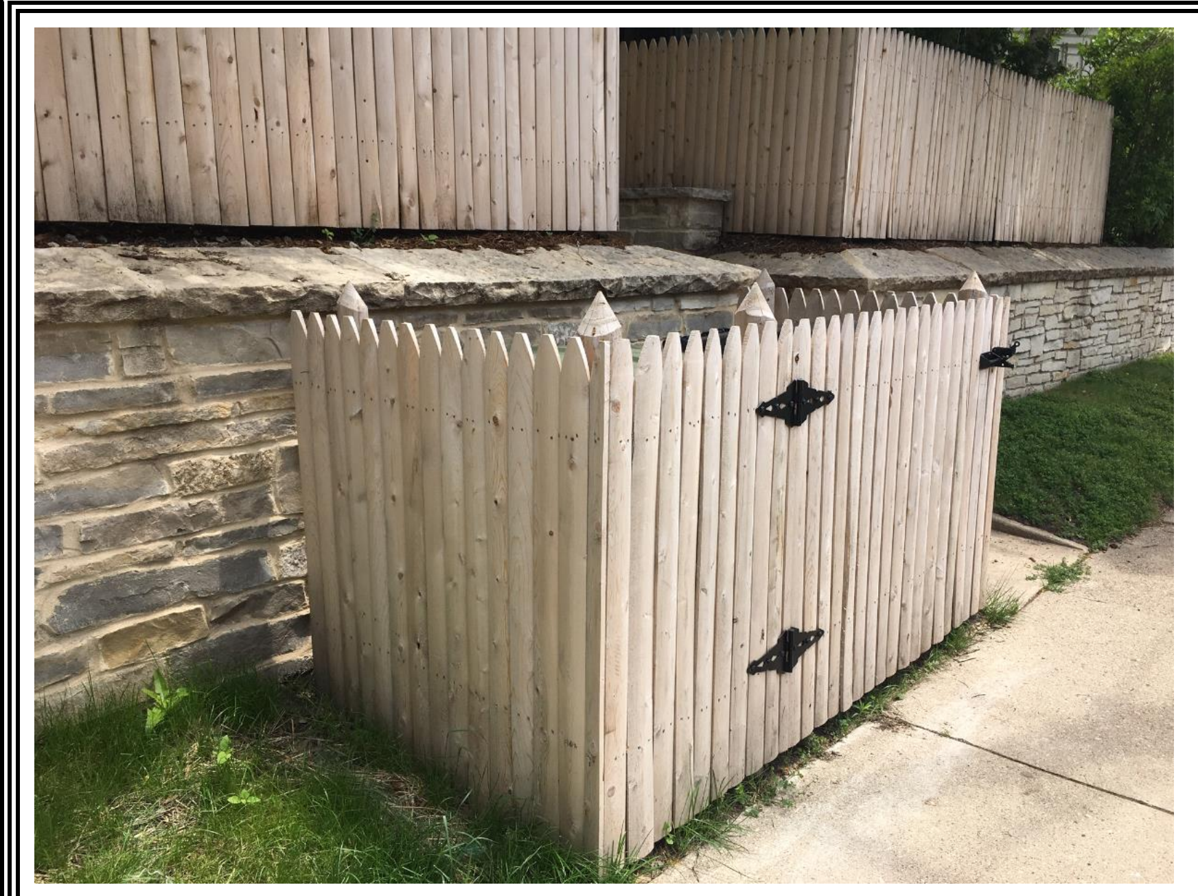
West Elevation – Corral detail

This is the view from Downer Ave. looking southeast. A small corralled enclosure at grade with the street features a 4'x4' gate.