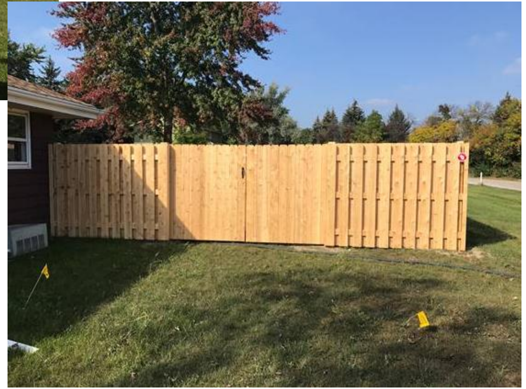
Image at right is to indicate gate and posts only. The shadowbox style fence is not permitted.

Fence design (6' high dog ear) will resemble the image above but include a 12'x6' double drive gate that resembles the photo to the right (paint or opaque stain required)