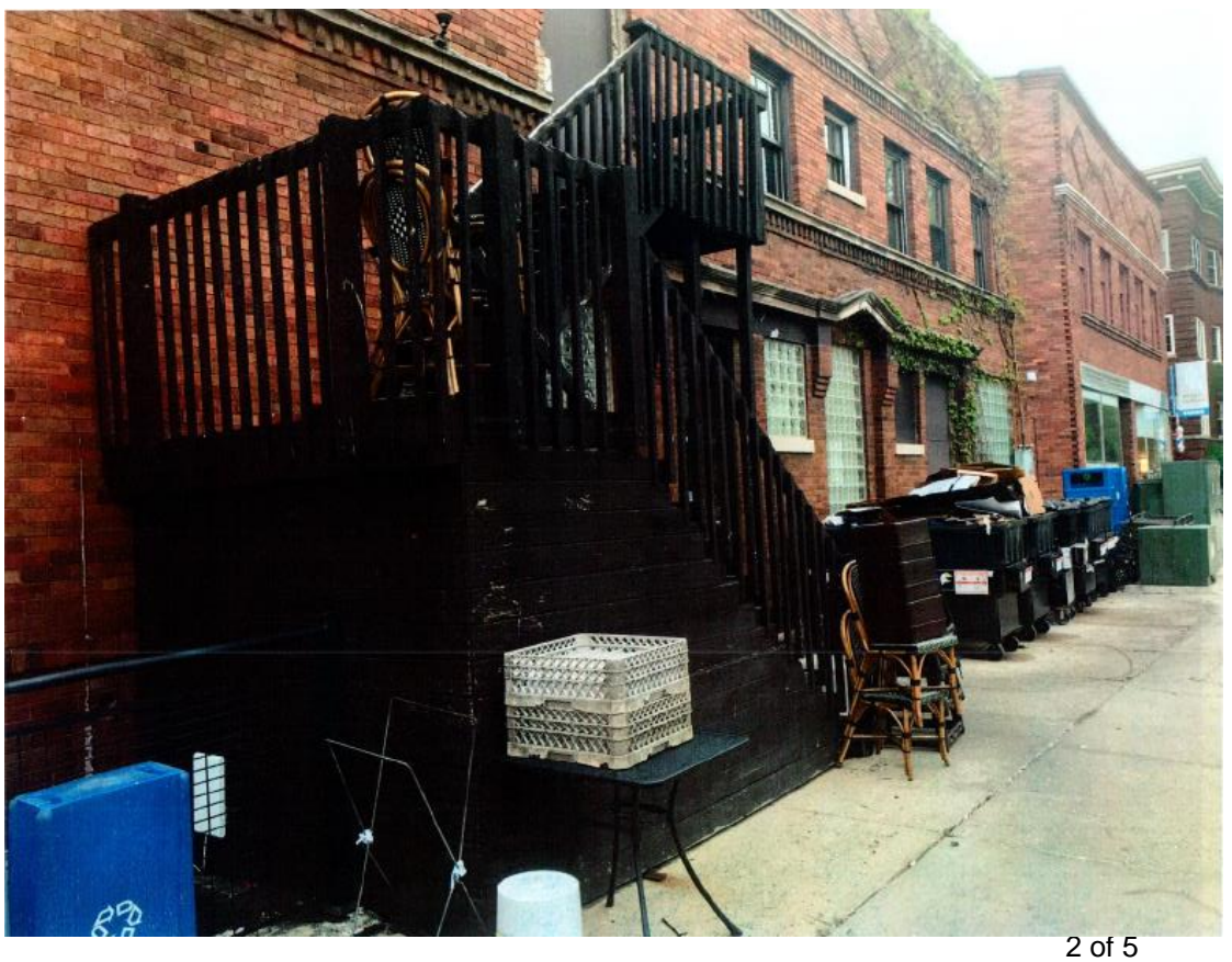
East Elevation along Hackett Ave