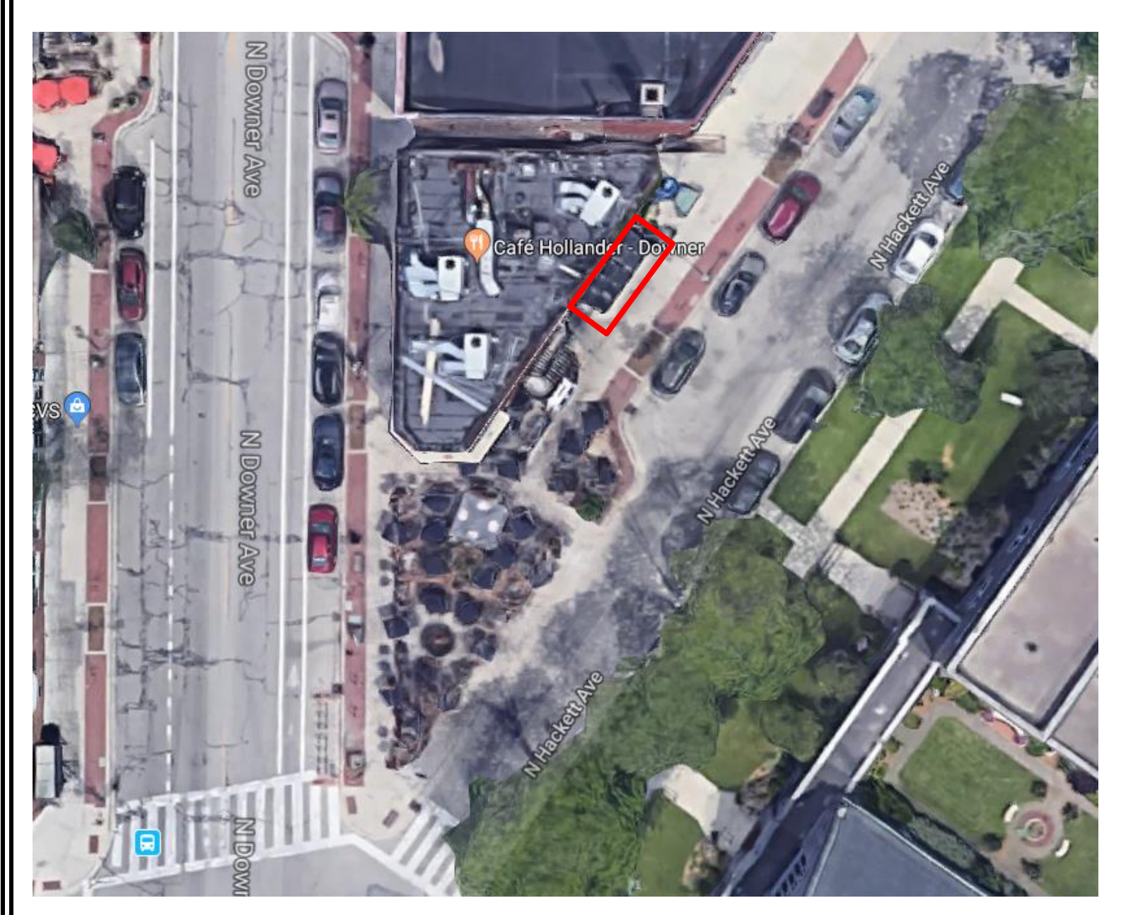
Approximate location of proposed fence/corral