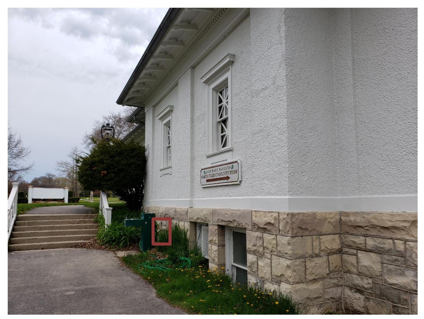
Image of the south elevation with an approximation of the location of the new air intake gooseneck (behind the drinking fountain) in red