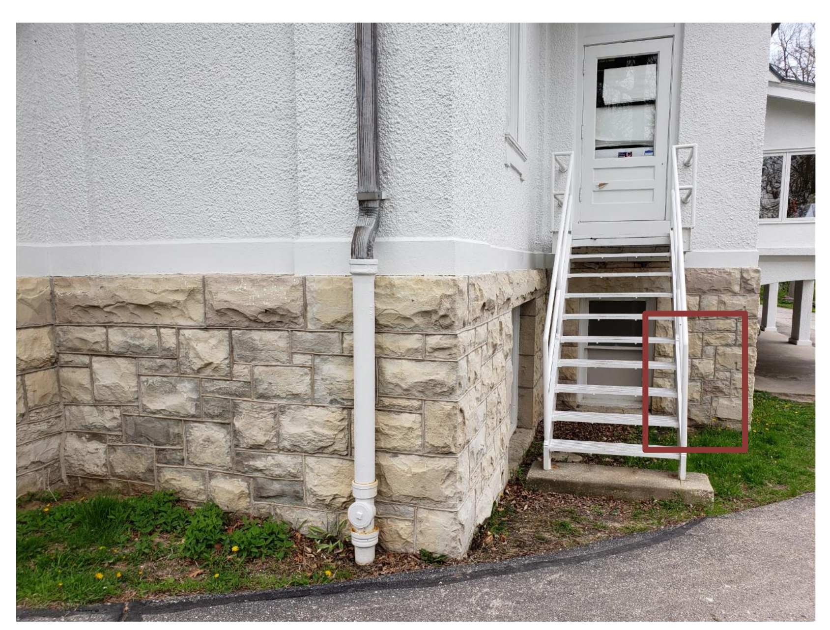
Image of the set of stairs under which the new condenser unit will be partially located, a rough estimation is indicated in red.