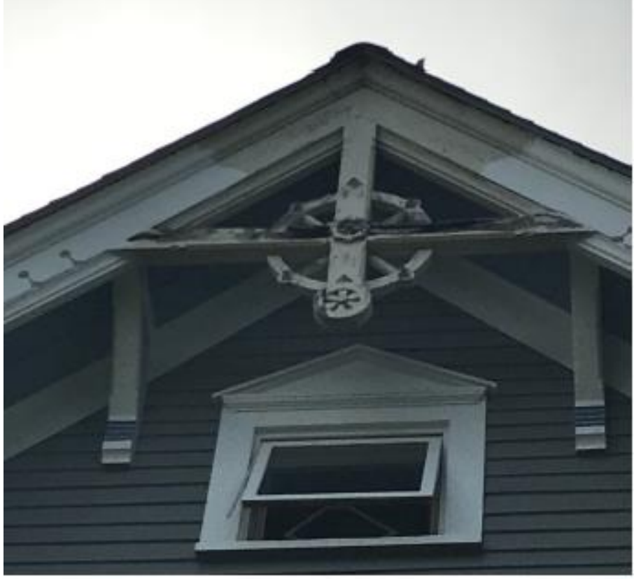
Existing gable ornament and detail of bargeboard and trim applicant MUST replicate the existing gable ornament EXACTLY