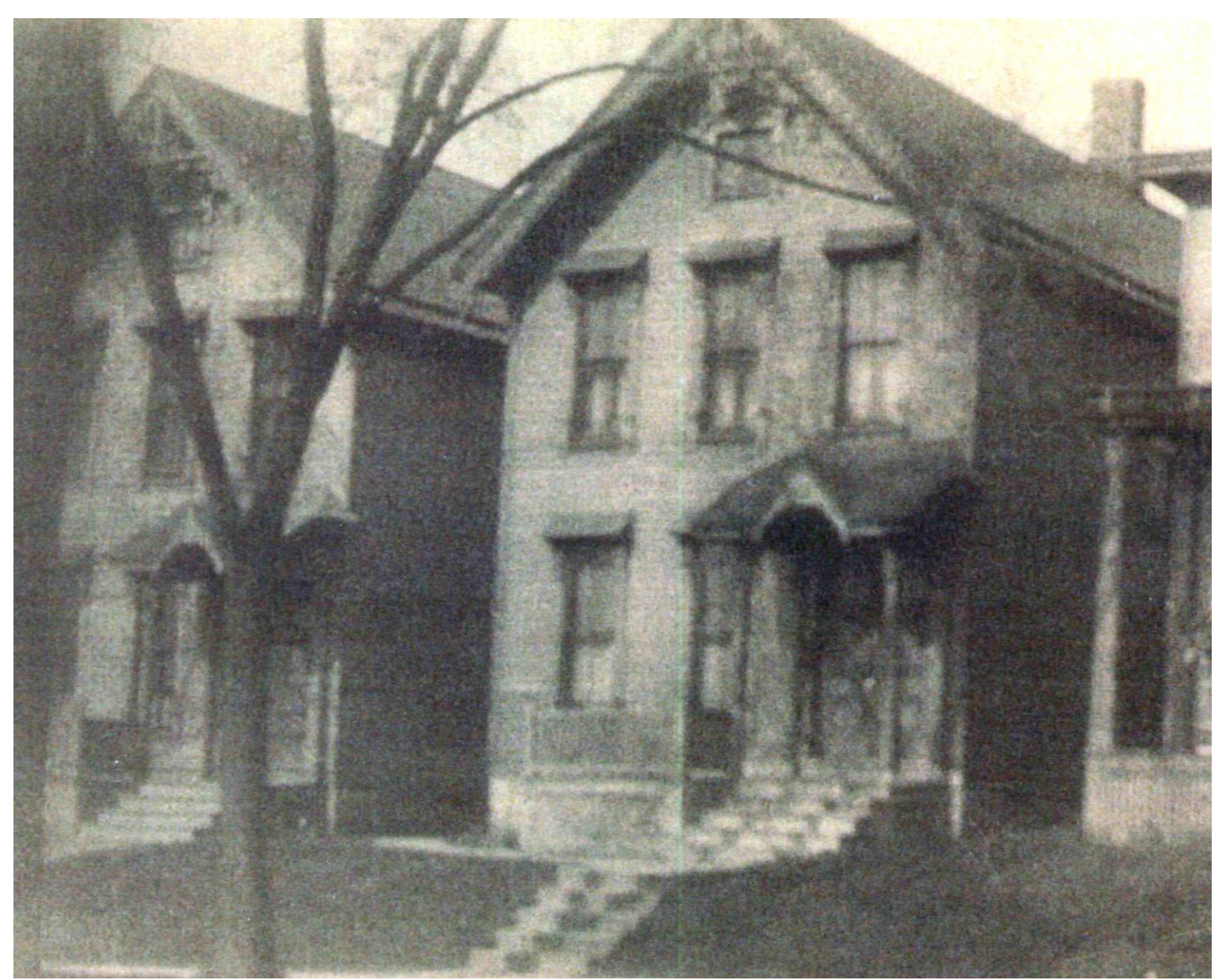
1920s photo showing twin houses with original gable ornaments