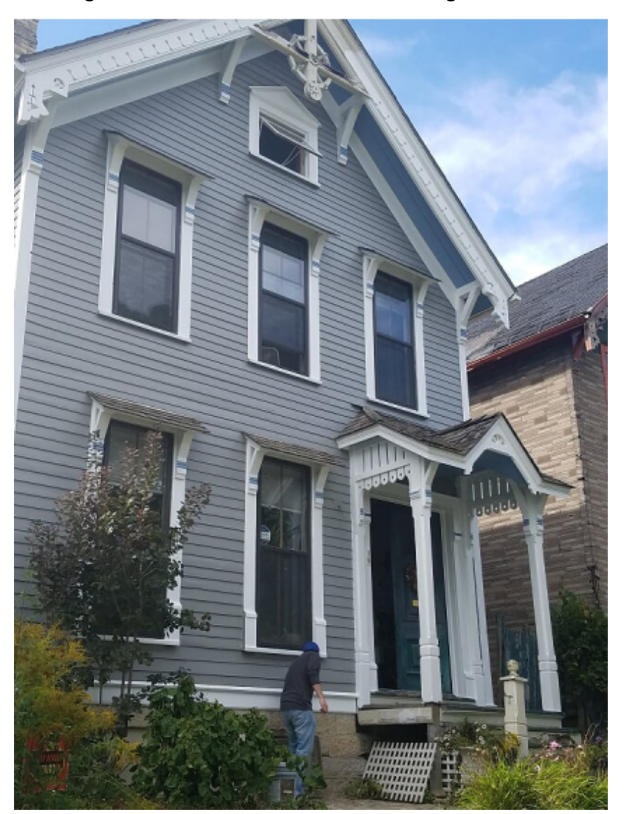
Existing Gable Ornament and Detail of Bargeboard, Trim, and Porch