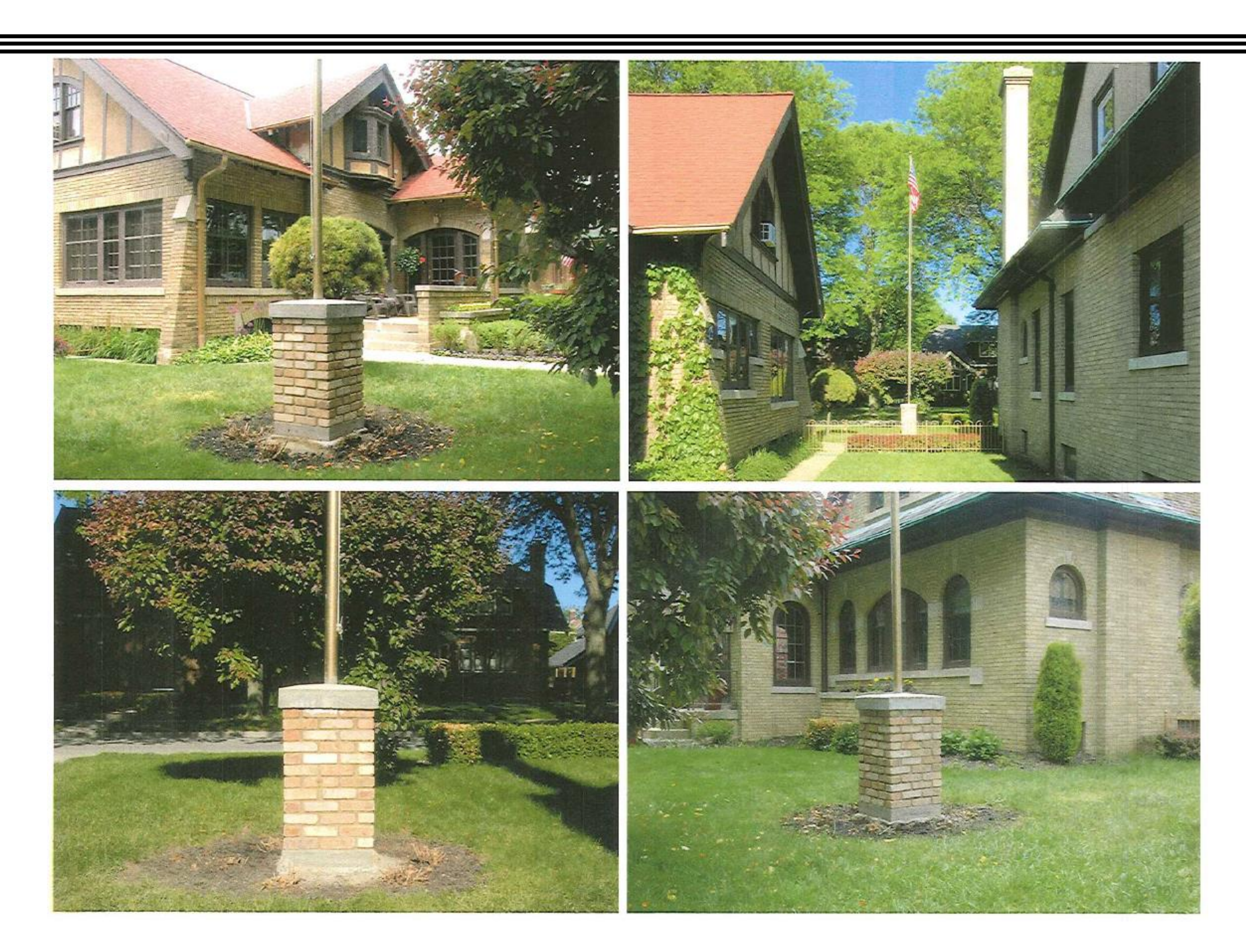
Present condition – replace bushes surrounding the base of the column