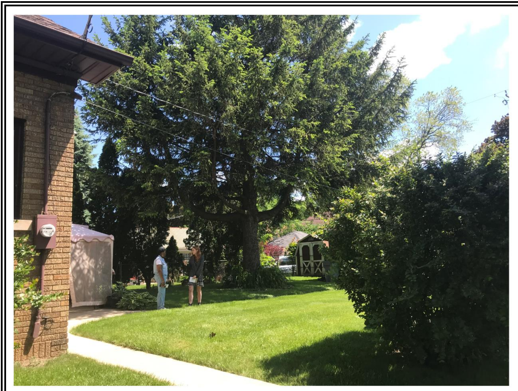
View of backyard where pergola will be sited – view has since been obscured by the installation of a fence/gate approved last month