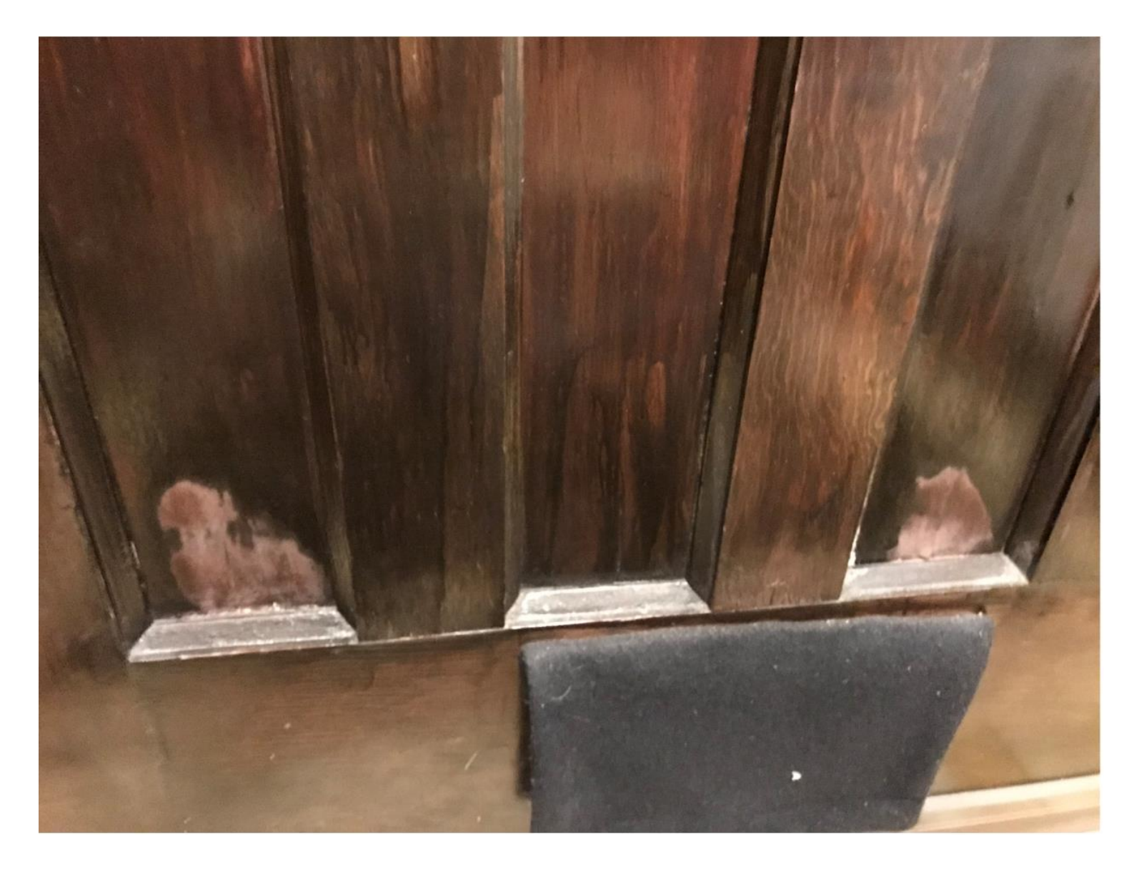
Present condition of the door from the interior