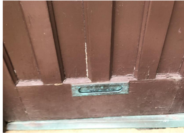
Present condition of the door from the exterior