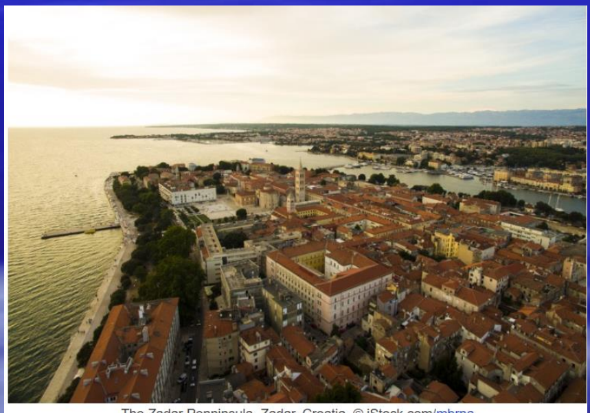
The Zadar Penninsula, Zadar, Croatia.

*Social *Economic *Recreational Importance