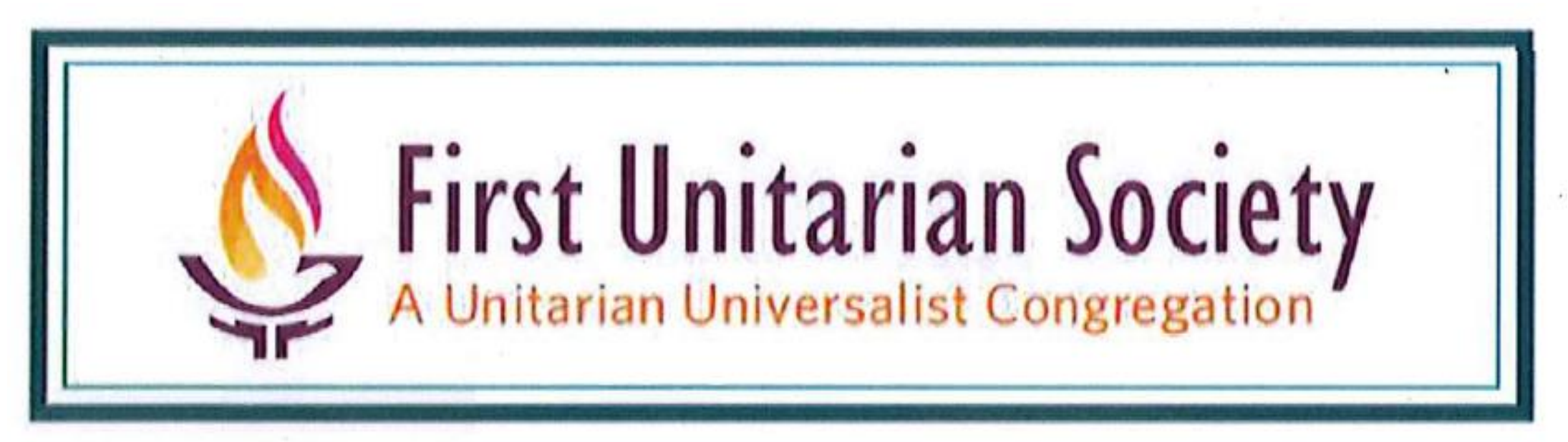
Proposed new graphics for existing sign