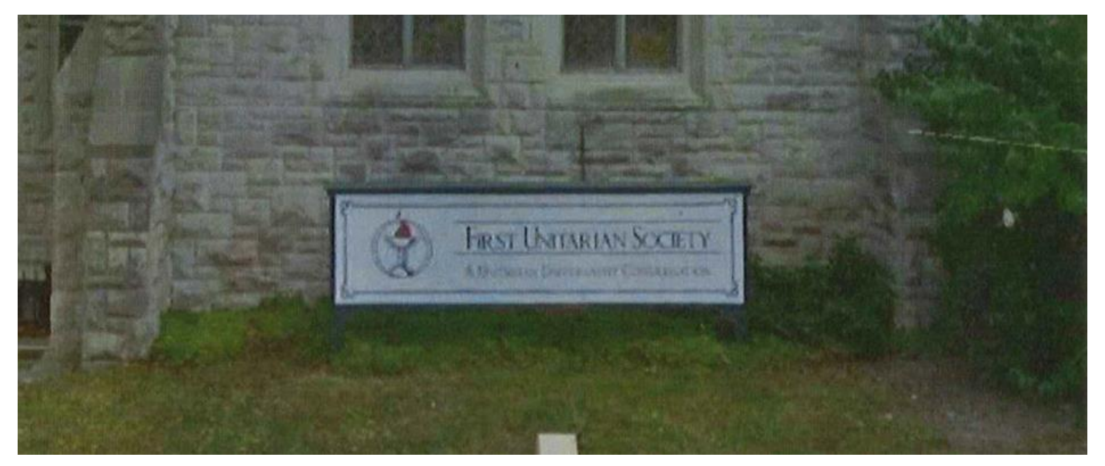
Appearance of existing monument sign