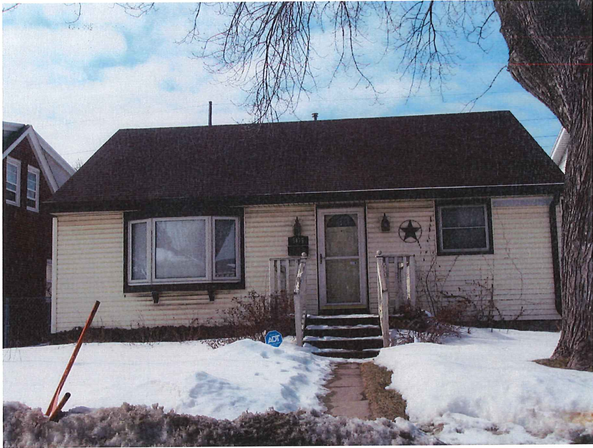
5835 North 76 th Street