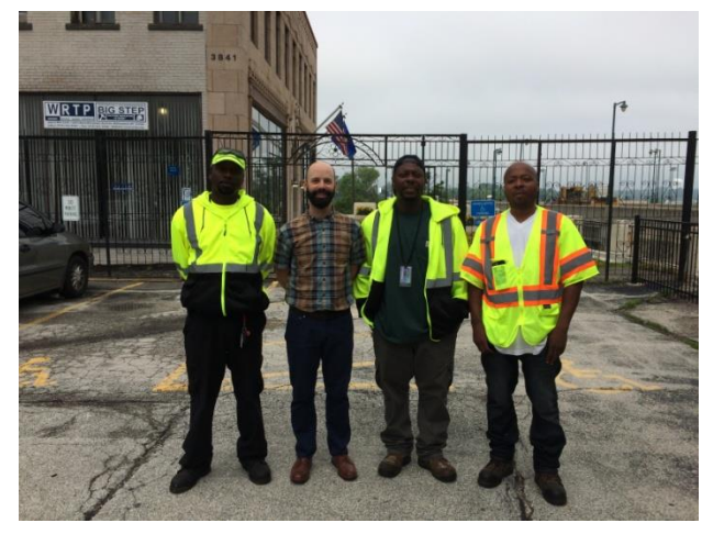
City staff (ODW, City Laborer) Alumni after speaking with current participants about civil service employment.

OSY participant interested in becoming a journeyman electrician