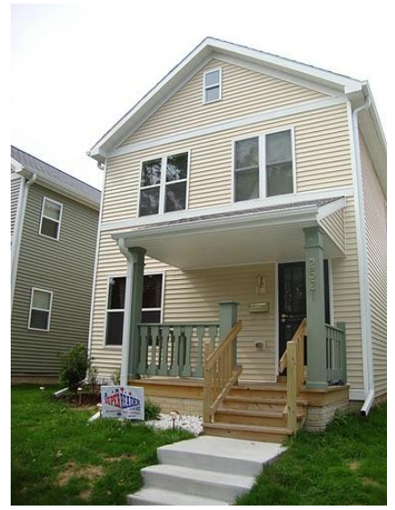
Sample House Design

The properties will be sold "as is" for $1 per lot. 2019 closing will occur within six months of Common Council approval, but in advance of construction to allow Habitat to obtain needed certified survey maps to create building sites. Subsequent closings will occur in each year of Habitat's build program for the Midtown neighborhood. Closing is subject to DCD approval of final house designs and site plans. The Purchase and Sale Agreement will include reversion of title provisions for non-performance. No earnest money or performance deposit will be required based on Habitat's past performance.