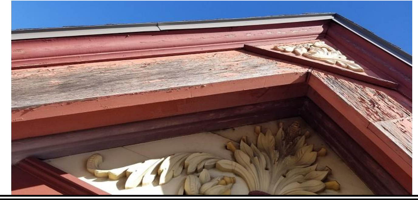
Rear gable in state of disrepair