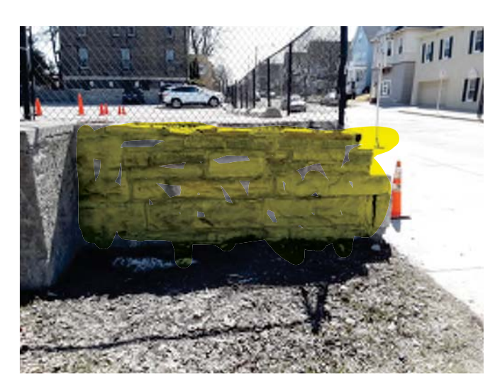
Reconstruct Highlighted Area With Integrity Masonry Units Proposed