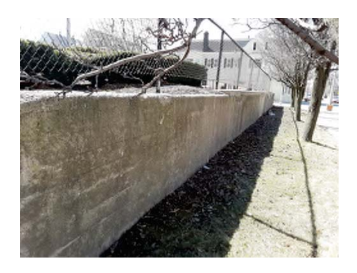
Existing Retaining Wall North / East of Repair Area-Lincoln Avenue