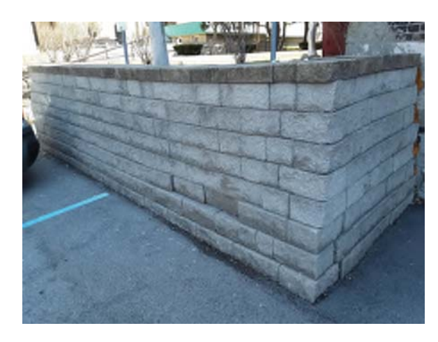
Example of Similar Replacement Material Split-Face Masonry Units Presently Used at Retaining Wall on South End of Parking Lot