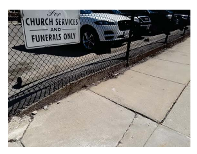
Existing Retaining Wall South of Repair Area- 7th Street