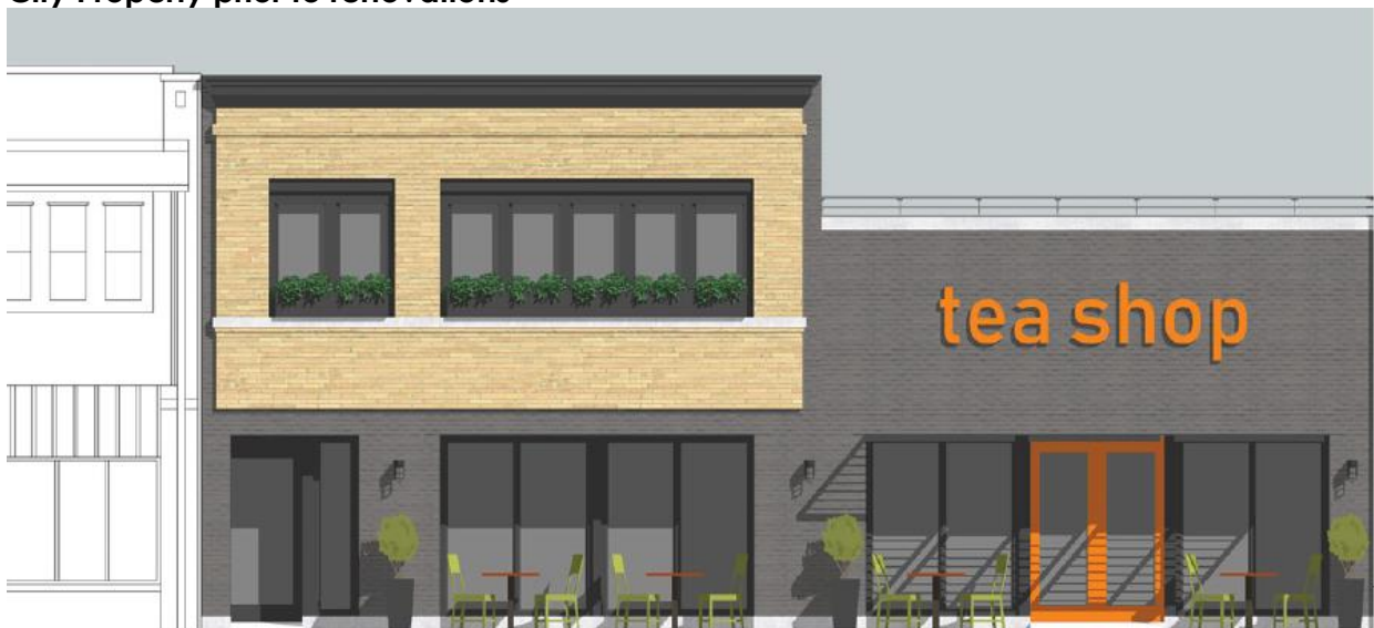
Rendering of exterior improvements