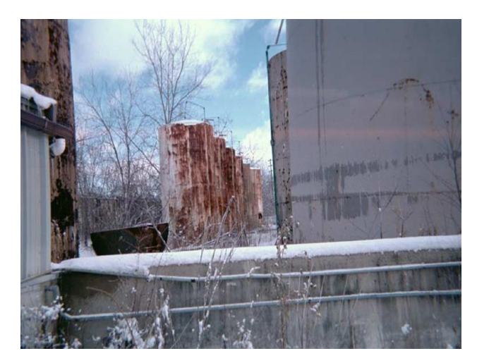
Pre-1992 US EPA Photographs of 1016(R) North Hawley Road (the "Property") Prior to Removal of Tanks and Drums

regulatory guidelines. Because of recognized environmental concerns, the Property is considered a brownfield so that under MCO 308-22-2-c, approval of acquisition of title by a 3/4 vote of the Common Council is required.