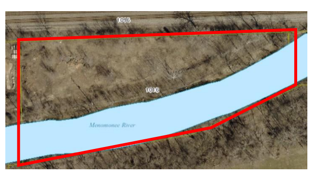
2018 Aerial Photograph