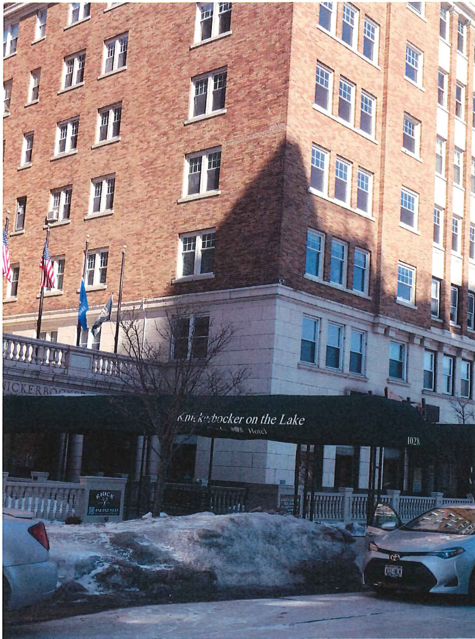
1028 E Juneau Ave – Unit 702