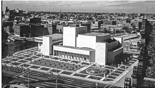
Marcus Center for the Performing Arts, Milwaukee, WI -, ca. 1970

In 1965 landscape architect Dan Kiley and Chicago architect Harry Weese were working together on the design of an arts complex at the University of Wisconsin, Madison. The two men had just completed their work on the IBM Headquarters in Milwaukee. During this period of fruitful collaboration, Weese was also commissioned to design the Milwaukee Performing Arts Center (now the Marcus Center for the Performing Arts) at 929 East Water Street in Milwaukee, and he asked Kiley to join him on the project. This would be a continuation of a long-term working relationship that included the Rochester (New York) Institute of Technology, Reed College in Portland, Oregon, the First Baptist Church in Columbus, Indiana (now a National Historic Landmark), Grant Park in Chicago, Illinois, and Forest Park Community College in St. Louis, Missouri.