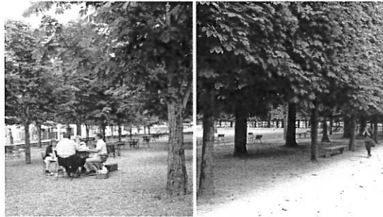
Marcus Center (left) and the Tuileries Gardens (right)

On December 7, 2018, the Marcus Center for the Performing Arts unveiled its vision for a reimagined campus, which called for the Dan Kiley landscape to be obliterated. The Marcus Center reportedly seeks to create a more open and flexible campus in order to help generate revenue and host more events. To achieve this, the current design proposes to replace the grove of horse chestnut trees with a large lawn intended to be used as a viewing area for outdoor performances. Moveable seating would be included on the lawn—an ironic nod to Kiley's original design, which included just that within the planted plaza, whose shade-giving trees would surely be missed, especially as temperatures, already on the rise, are only projected to increase in the coming decades.