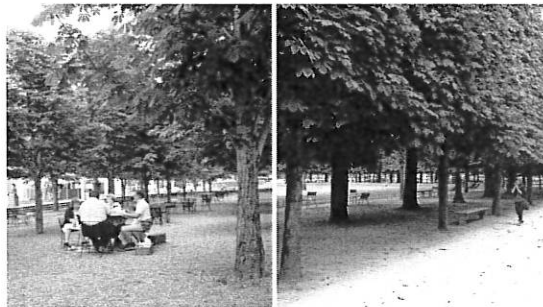
Marcus Center (left) and the Tuileries Gardens (right)

On December 7, 2018, the Marcus Center for the Performing Arts unveiled its vision for a reimagined campus, which called for the Dan Kiley landscape to be obliterated. The Marcus Center reportedly seeks to create a more open and flexible campus in order to help generate revenue and host more events. To achieve this, the current design proposes to replace the grove of horse chestnut trees with a large lawn intended to be used as a viewing area for outdoor performances. Moveable seating would be included on the lawn—an ironic nod to Kiley's original design, which included just that within the planted plaza, whose shade-giving trees would surely be missed, especially as temperatures, already on the rise, are only projected to increase in the coming decades.