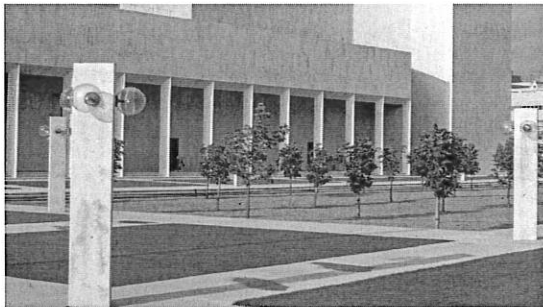
Marcus Center for the Performing Arts, Milwaukee, WI - Photo by Joe Karr, ca. 1970

The grid of horse chestnuts also speaks directly to Kiley's time in Europe, specifically in Paris, France, where, as has been noted, he was the landscape architect of the garden of the Tuileries (also planted with horse chestnut trees), the imperial palace on the right bank of the Seine. What Kiley recognized there—and translated to great advantage in Milwaukee—was “a language of form used to conduct the movement of daily life...a language with which to vocalize the dynamic hand of human order on the land—a way to reveal nature's power and create spaces with structural integrity,” as he put it. He would also recall that his experience at the Tuileries opened his eyes to “the spatial and compositional power of the simplest of elements—this was no less than living architecture.” The Performing Arts Center's plaza in Milwaukee is a virtual illustration of these thoughts and words.