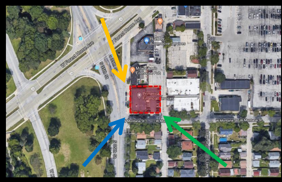
View from South 35th Street looking south