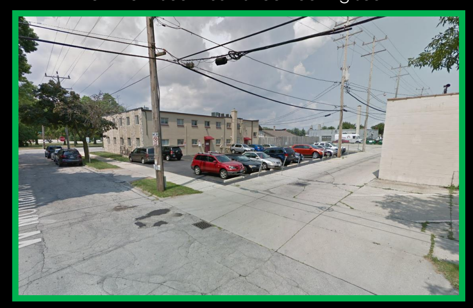
View from West Montana Street looking north-west