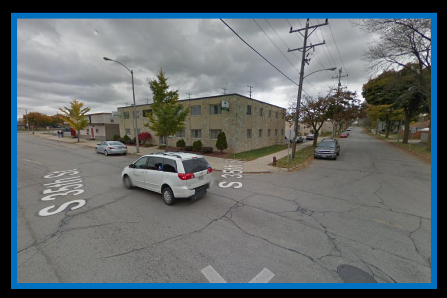
View from Montana and 35th looking north-east