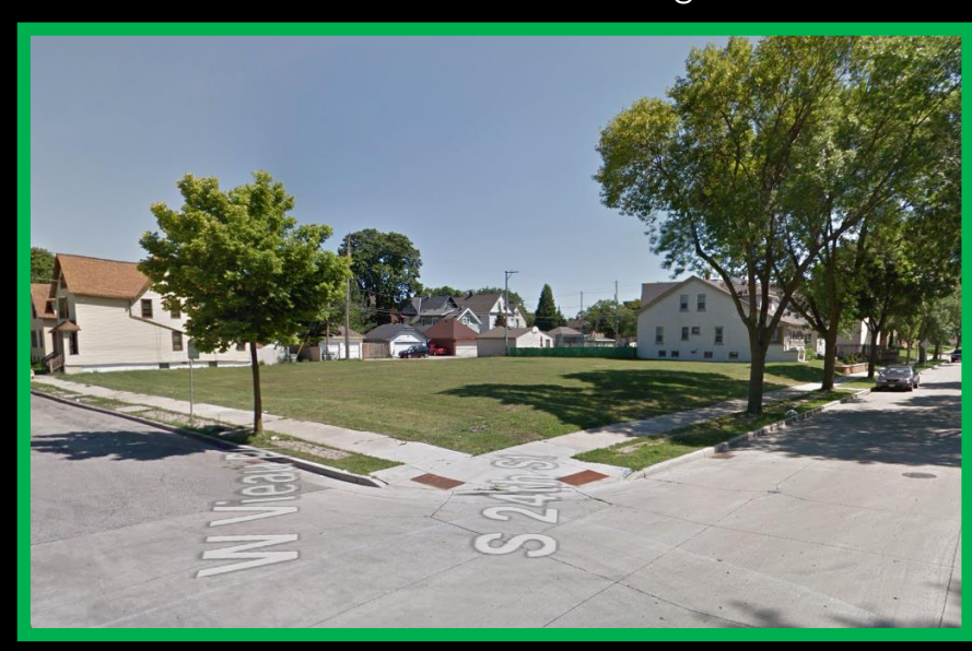
View from S. 24th and W. Vieau looking south-east