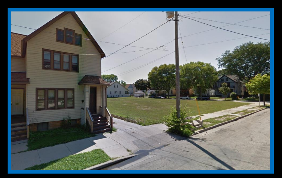
View from West Vieau Place looking south-west