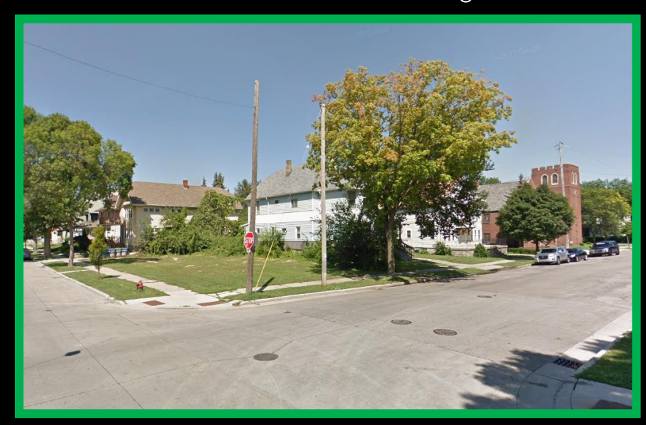
View from South 24th Street looking north-east