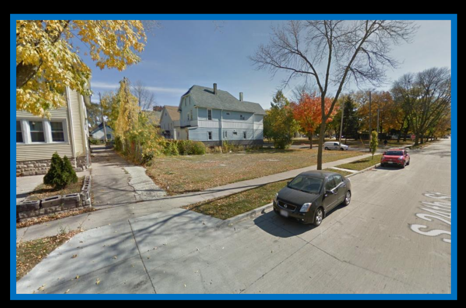
View from South 24th Street looking south-east