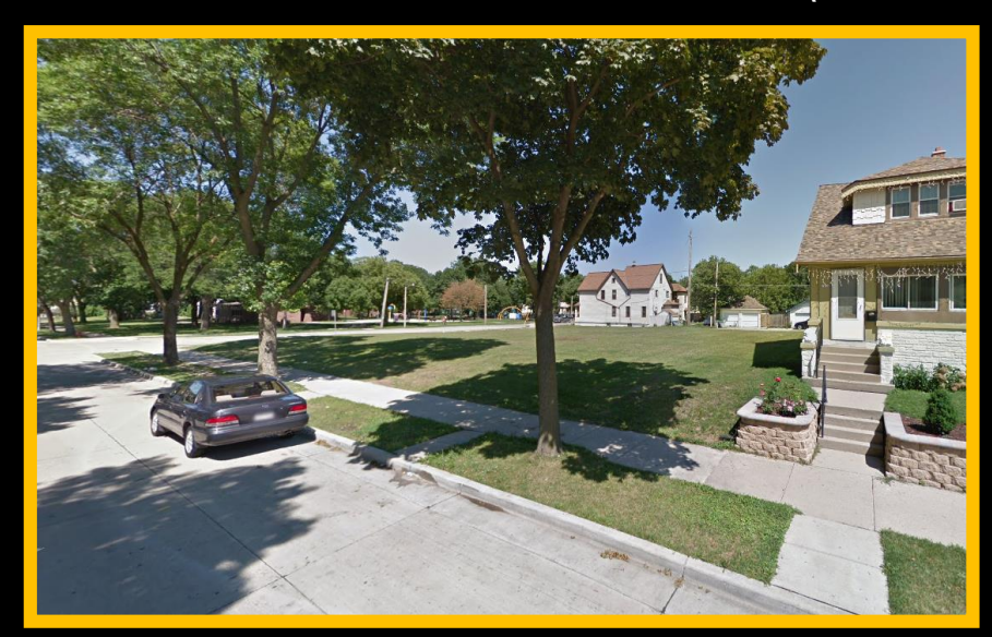
View from South 24th Street looking north-east