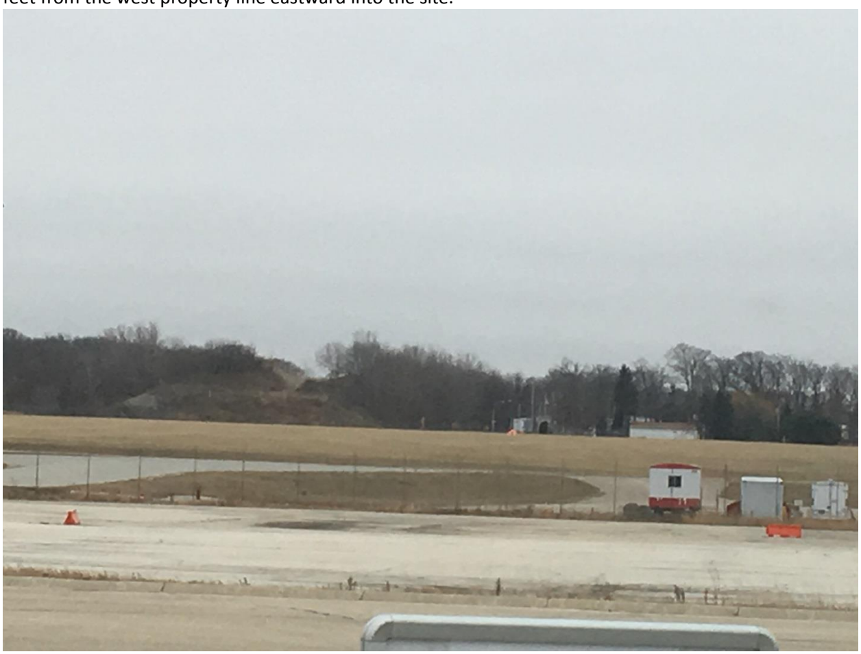
Overlay Zone Boundary:

Taken from a distance. White building in the background is a residence on the west side of 6<sup>th</sup> Street. The existing berm/hill on the subject site is on the left. This hill must be maintained for a distance of 50 feet from the west property line eastward into the site.