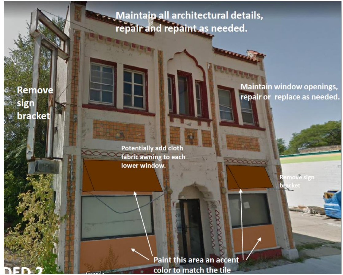
City property with DRT exterior recommendations