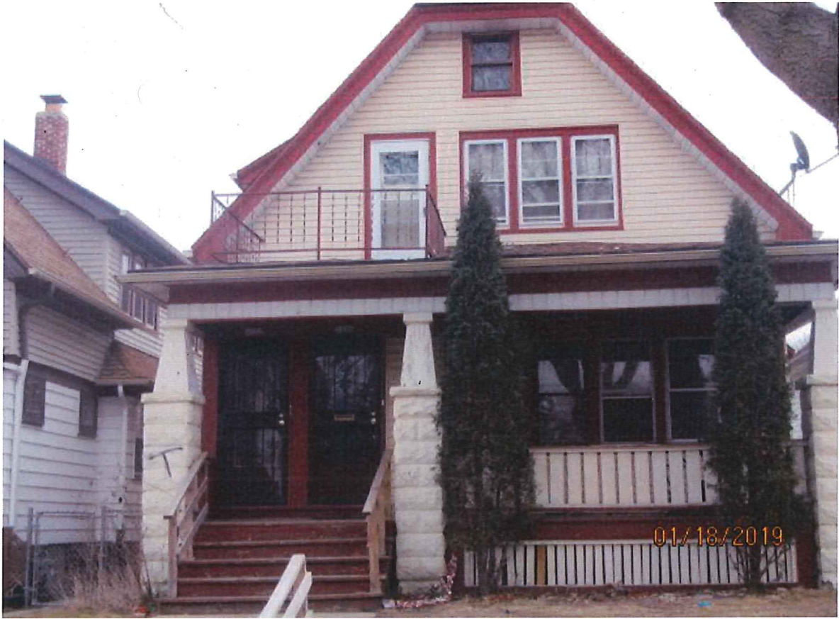
3320 n 25 th Street